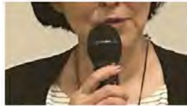
Masumi Fukuda, here delivering a speech 23rd Sep. 2024 in Chiba City, Japan.

"There is no value in covering the 'victim narratives' of anti-social groups. It's all irrelevant."