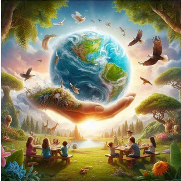
God and humankind