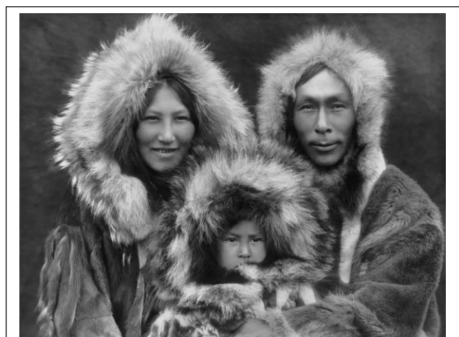
It's the child who makes them parents. A family portrait of an Inupiat Eskimo mother, father, and son. Photographed in Noatak, Alaska, circa 1929

"This is my son, and this is my daughter in whom I am well pleased."