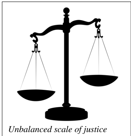
Unbalanced scale of justice

The First Petty Bench of the Supreme Court, with Justice Makoto Nakamura (中村誠) as presiding judge, issued a verdict 3rd March that upheld a previous ruling by Tokyo High Court in August 2024 that had imposed a 100,000 yen (ca. $ 670) fine on Tomihiro Tanaka (田中富広), the chairman of the Family Federation in Japan. Its appeal was thereby dismissed, and the verdict finalized the proceedings regarding the fine. The ruling was reached unanimously by all five justices.