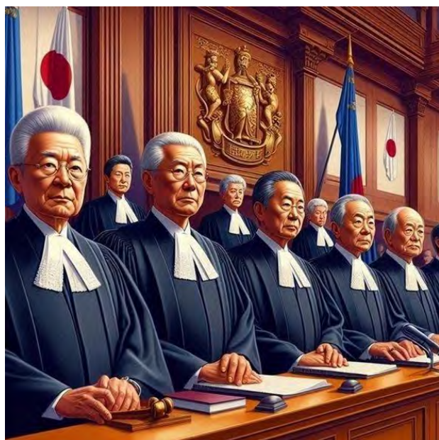
Japanese Supreme Court judges

Large daily reports that Supreme Court ruling weighs in on current Family Federation dissolution case with ominous precedent set