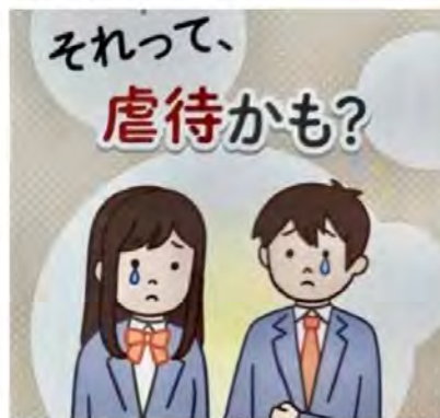
From the cover of a pamphlet used in Japanese schools. It explains that they may be abused by being "forced to participate in religious activities" and "threatened by words like 'You will go to hell.'"