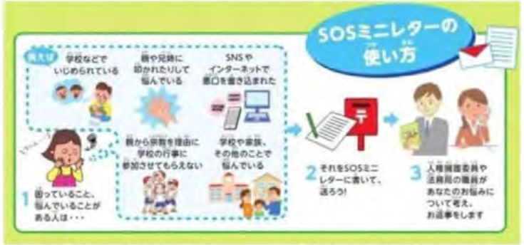
From the "SOS Mini Letter." One example of abuse is "Because of my parents' religion I cannot participate in sport events."

The measures included in the January 2024 governmental plan consist of: