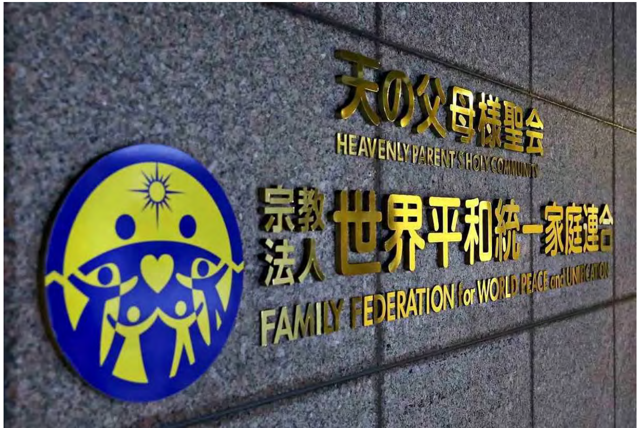
The entrance of the headquarters of the Family Federation of Japan in Shibuya, Tokyo