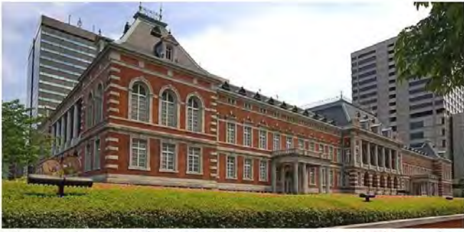
Ministry of Justice Older Administration Building in Chiyoda-ku, Tokyo, Japan. Photo (2007): 663highland / Wikimedia Commons. License: CC ASA 3.0 Unp. Cropped

According to Duval, the governmental plan aims primarily to create an environment in which children and young individuals – particularly second-generation members of religious communities – are encouraged to report perceived abuses or victimization related to their parents' faith. To facilitate this, several initiatives are being reinforced, such as expanding "Human Rights Classes" from elementary schools to junior high and high schools and increasing the distribution of the "Children's Rights SOS Mini-Letter".