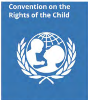
A logo of the UN Convention on the Rights of the Child.