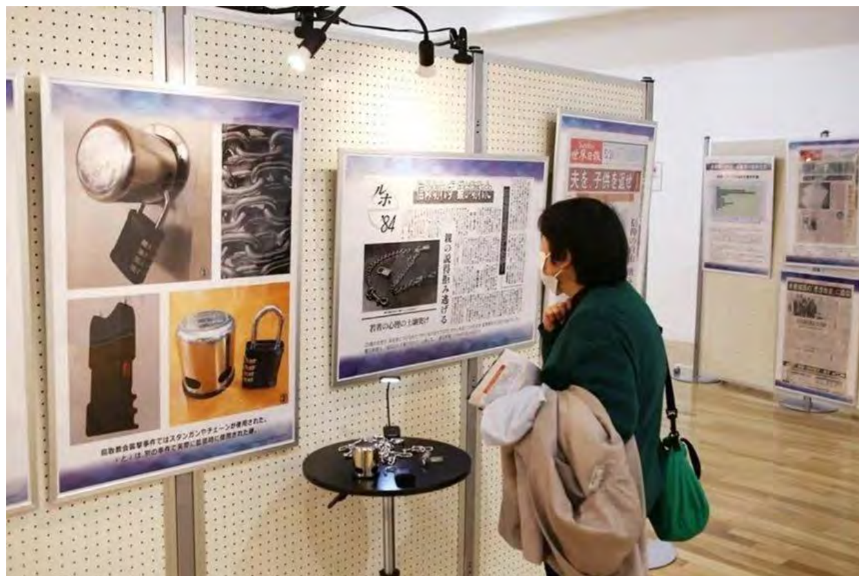
Exhibition introducing the realities of abduction, confinement, and coercive faith-breaking - January 11, 2025, Sugunami Ward, Tokyo