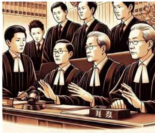
Japanese Supreme Court judges. Illustration: Microsoft Designer Image Creator, 5th March 2025.

The Supreme Court has dismissed the appeal of the Family Federation for World Peace and Unification (formerly the Unification Church ) in a case where Japan's Ministry of Education, Culture, Sports, Science and Technology (MEXT) sought to impose an administrative fine on the religious organization . The ministry had requested the fine after the organization refused to answer certain questions related to the government's request for a dissolution order.