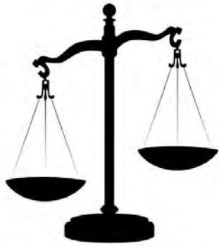
Imbalanced scale of justice.

Following this ruling, the Family Federation released a statement on 5 th March 2025 in response to the Supreme Court's decision . The statement criticized the court for not making a constitutional judgment and for failing to specify which laws had been violated. The organization also warned that the ruling posed a "serious threat" to other religious corporations involved in civil litigation and claimed that it would "damage Japan's international credibility". Furthermore, the religious organization reiterated that it had