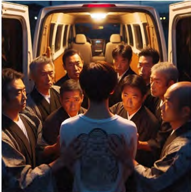
Young believer being abducted in order to have his faith broken.