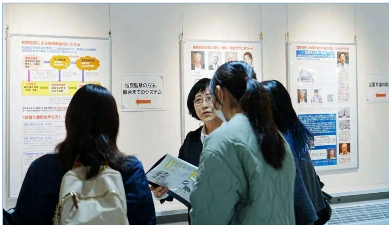
A panel exhibition raising awareness about abduction and confinement victims - March 19, 2025, Yokohama, Kanagawa Prefecture, Japan