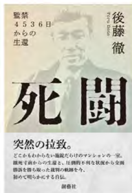
Front cover page of Japanese edition of Toru Goto's new book “Deadly Struggle: Surviving 4,536 Days of Confinement” (Sageisha)