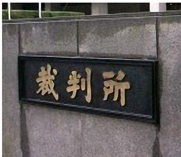
The sign outside Tokyo District Court