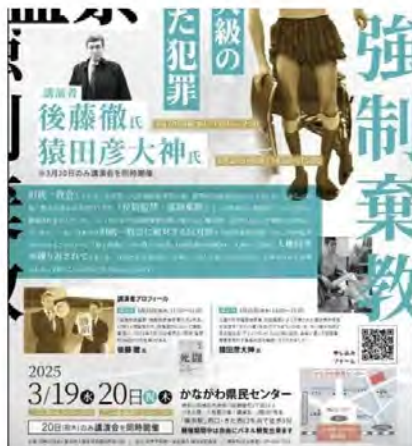
Poster used for the exhibition in Yokohama, Japan 19th and 20th March 2025.