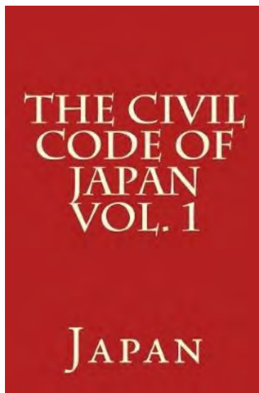
English reproduction of The Civil Code of Japan, vol. 1, 4th edition, first published 1906

Although NHK World does not mention specifically that the authorities changed the law to specifically target the Family Federation , the large state-run media outlet writes,