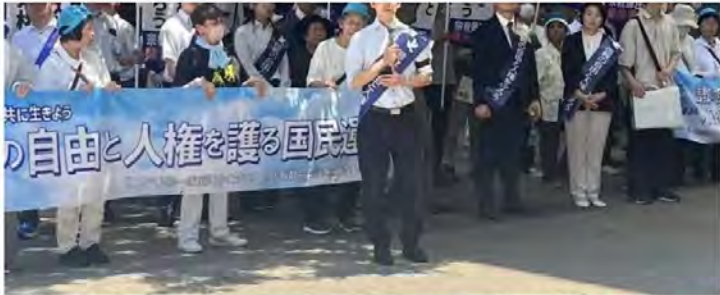
A believer appeals to the public about the situation of the Family Federation in a busy shopping district – 29th June 2025, Matsuyama City, Ehime Prefecture.

And still more, related to not constitutional to use civil code: Journalist Reveals Ugly Leftwing Conspiracy