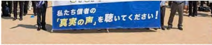
Believers rallying in Osaka City – 29th June 2025, Kita Ward, Osaka City

According to the religious organization's public relations office, other protest marches took place in Nagoya City (about 600 people), Saitama City (about 150), Fukushima City, Fukushima Prefecture (about 300), and Mito City, Ibaraki Prefecture (about 230). Over the two days, more than 4,000 believers participated in the protest marches nationwide.