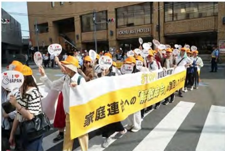
Believers holding banners march near JR Kichijoji Station – 29th June 2025, Mitaka City, Tokyo.

Also related to not constitutional to use civil code: After the N-Word: Is “Cult” Next Term to Be Banned?