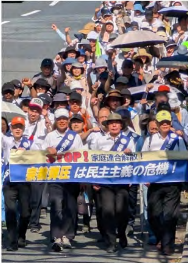
Believers marching through Osaka City – 29th June 2025, Kita Ward, Osaka City