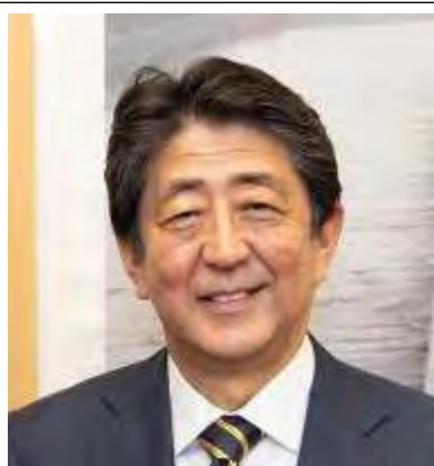
Shinzo Abe in March 2022, few months before he was assassinated

- During the campaign, 8th July marks the third anniversary of former Prime Minister Shinzo Abe's assassination. What are your plans?