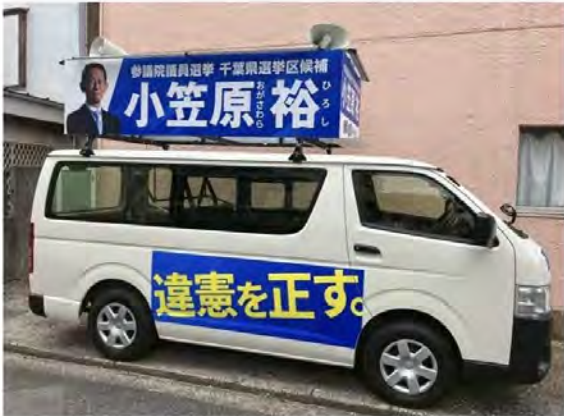
From Hiroshi Ogasawara’s campaign July 2025.

Since last year, I’ve been expanding activities around the theme of religious freedom, including hosting symposiums in the prefecture. However, I became gravely concerned that national political parties were unilaterally cutting ties with the religious organization , leaving believers with no voice in national politics.