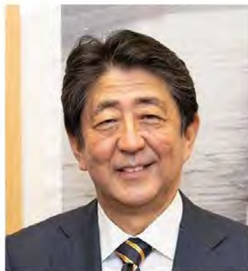
Shinzo Abe in March 2022, few months before he was assassinated.

I'm planning to hold a street memorial speech for Shinzo Abe (安倍晋三) and offer a silent prayer at 11:30 a.m., the time he was attacked. It's unbearable to see a man who did so much for Japan now being disparaged as "deeply entangled" (with the religious organization ). Even LDP candidates likely won't hold memorials, but at the very least, our group will.