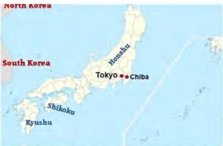
Location of Chiba City (population about 1 million), located on the main island of Honshu. Illustration: Maximilian Dörrbecker (Chumhwa) / Wikimedia Commons. License: CC ASA 3.0 Unp

Additionally, our group believes that respecting family and local culture is essential to national strength. Specifically, we aim to amend the