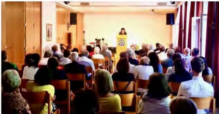
From the celebration on 4th July 2025, of the 10th anniversary of the official recognition of the Unification Church in Austria.