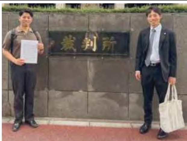
A representative of Association of Second-Generation Members to Protect the Human Rights of Believers and a legal representative outside Tokyo High Court July 10, 2025.