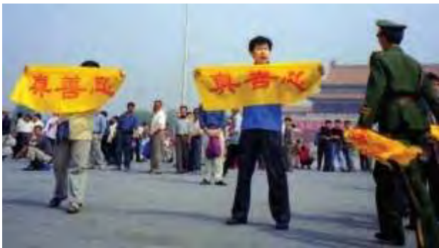
Falun Gong protesters about to be arrested in Tiananmen Square in Beijing in the early phase of the persecution

If the Chinese Communist Party applauds Japan's actions, something is gravely wrong. Democracies should never adopt tactics that win praise from authoritarian regimes.