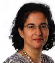
Sent formal UN request to Japan, but no reply:

Significantly, UN Special Rapporteur Nazila Ghanea publicly raised concerns about the case and offered to visit Japan to investigate potential FoRB violations. 3 To date, the Japanese government has failed to respond to her repeated requests.