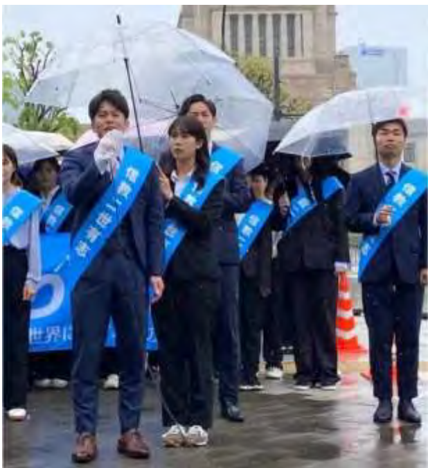
Second-generation members of the Family Federation protesting 6th May 2025 outside the Japanese parliament against the dehumanizing treatment inflicted on them by the authorities in league with militant lawyers

And in some tragic cases, depression and suicide