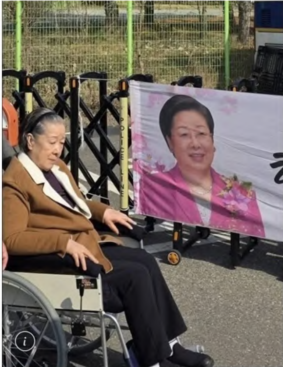
Hak Ja Han