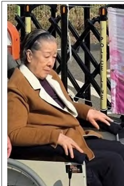
Being detained without evidence for more than seven months for allegedly meddling in South Korean politics: Mother Han , here being released on 27th March 2026 for urgent medical treatment after being held long-term in a tiny cell

See also Is It Civic Education or Political Involvement?