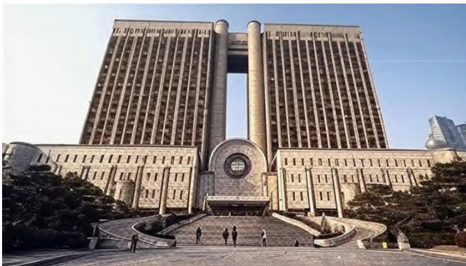
The building housing Seoul Central District Court.

The case has drawn significant public attention in the country. The religious movement has long claimed that its involvement in public affairs is educational or moral rather than directly political. Yet, the current left-leaning Lee Jae-myung administration has appointed "special prosecutors" in order to investigate allegations that senior figures within the Family Federation attempted to influence the country's 2022 presidential election, potentially violating laws governing political funding and improper lobbying.