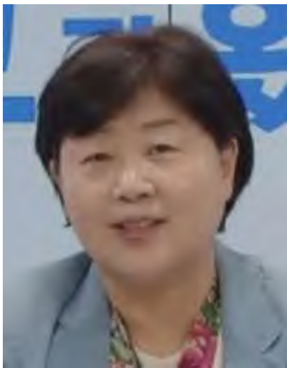
Democratic Party lawmaker Seo Yeong-gyo