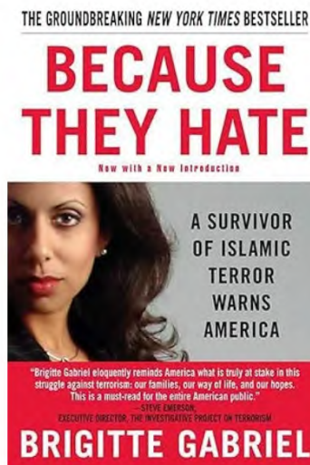
The front cover page of Brigitte Gabriel's Because They Hate – A Survivor of Islamic Terror Warns America", published by St. Martin's Griffin, 2004.

To further develop this point, Carlson draws extensively on the writings of author and commentator Brigitte Gabriel, who was raised in Lebanon during periods of violent conflict involving militant Islamist groups. Gabriel's books "Because They Hate" and "They Must Be Stopped" are presented as warnings to Western nations about the dangers posed by radical Islamic extremism. Carlson highlights Gabriel's argument that understanding the historical roots of ideological conflict is essential for interpreting present events and preparing for future challenges.