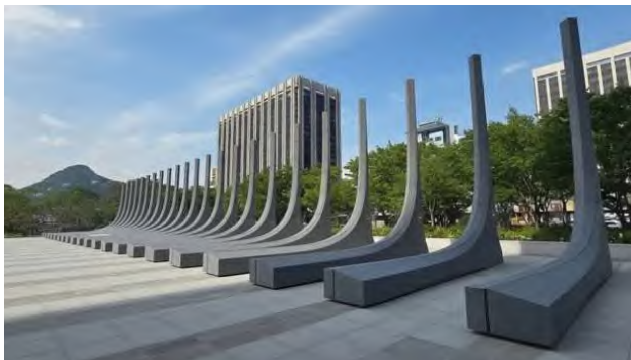
23 Stone Pillars at Garden of Gratitude at Gwanghwamun Square in Seoul. Illustration: Grok xAI