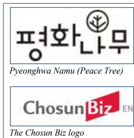
Pyeonghwa Namu (Peace Tree)