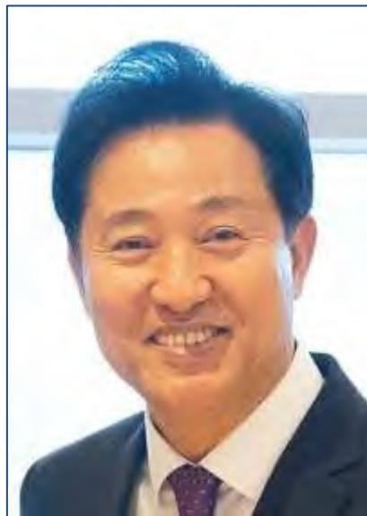
Seoul Mayor Oh Se-hoon, here in September 2023

The Pyeonghwa Namu article also revisited earlier controversy involving Oh Se-hoon and Unificationism , noting that the mayor had previously drawn criticism in 2021 for sending congratulatory remarks to an event hosted by the religious organization. The report framed the current allegations within a broader narrative of possible political and institutional proximity between Oh and Unificationism-affiliated interests.