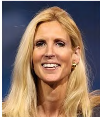
Ann Coulter, here speaking at the 2013 CPAC in Washington D.C. on March 16, 2013. Cropped