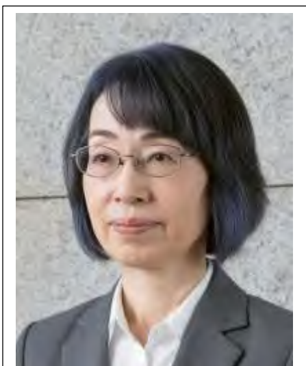
AI-illustration of Justice Masami Okino - Image: Grok xAI

Shattered hope for judicial impartiality in decisive Supreme Court hearings as court rejects bid to remove justice with ties to hostile network of lawyers