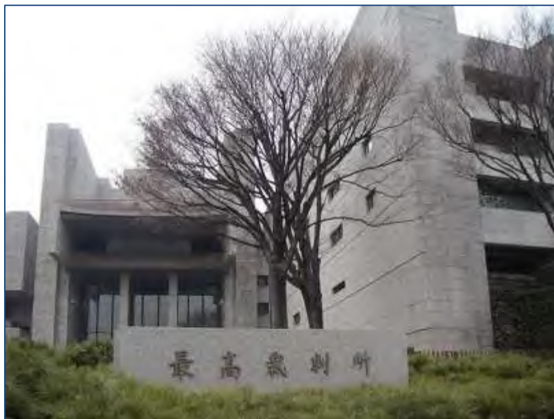
The Supreme Court of Japan (Saikōsaibansho)