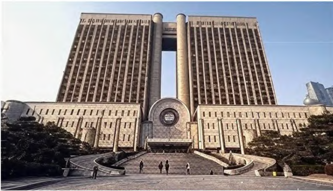
The building housing Seoul Central District Court.

Mother Han , one of the most influential religious figures in modern South Korean history, is currently standing trial on charges pressed by special prosecutors appointed by the current left-leaning Lee Jae-myung (이재명) administration. They are investigating whether organizations connected to the Family Federation supported leading politicians or sought influence in legally prohibited ways.