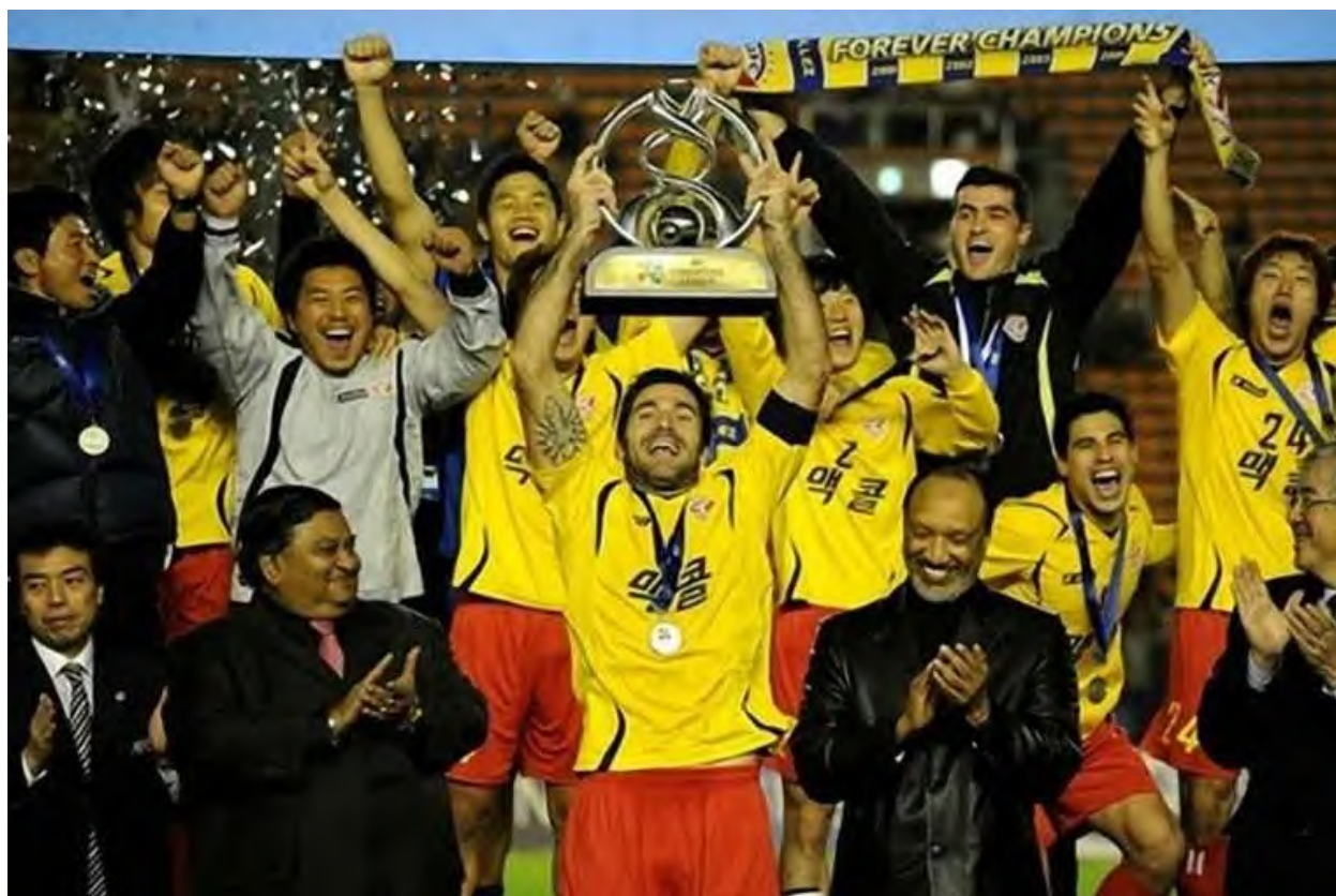
Seongnam Ilhwa Cheonma celebrating the victory in the Asian Champions League 13th November 2010 after defeating the Iranian team Zob Ahan 3-1 in the final in Tokyo, Japan

Under his leadership, Seongnam Ilhwa became one of the most successful clubs in Korean football history, winning seven domestic championships - in 1993, 1994, 1995, 2001, 2002, 2003, and 2006 - and establishing a reputation as one of Asia's leading football organizations. The club won five international titles: 1995 Asian Club Championship, 1996 Asian Super Cup, 1996 Afro-Asian Club Championship, 2004 A3 Champions Cup, and 2010 AFC Champions League.