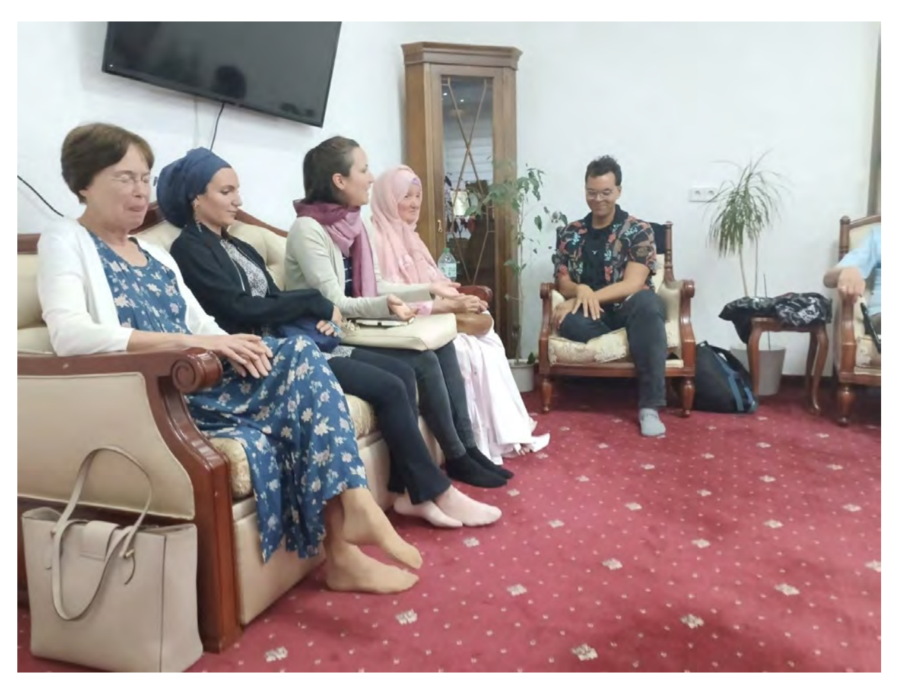
The interreligious circle of the Universal Peace Federation met on Saturday, July 13, 2024, in the Fatih Mosque in Munich Giesing to celebrate the Muslim Feast of Sacrifice (Kurban), which commemorates