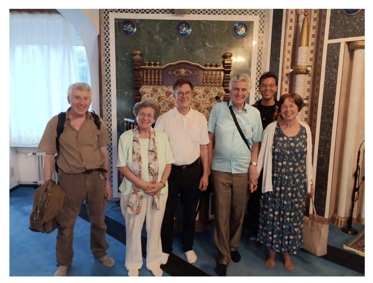
On 13 July 2024, the interreligious circle of UPF Munich asked the question, "Can Abraham still be the base for an integrating force for peace today?"