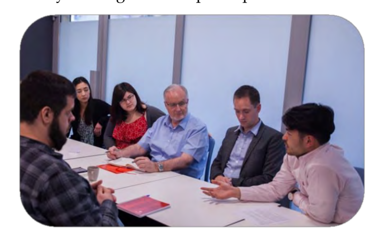
Lively discussion during the networking session.

In the afternoon, participants joined various breakout sessions that included workshops and presentations on the following themes: 'culture of change' and