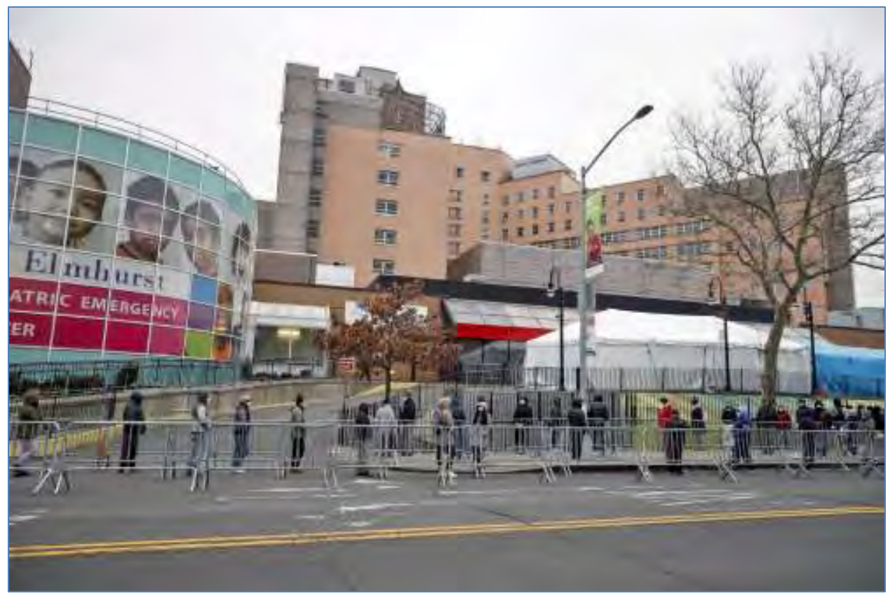
Queens residents wait in line to be tested for COVID-19 outside Elmhurst Hospital Center on March 25, 2020. In the last week of March, Elmhurst Hospital became the "center of the center" of the COVID-19 pandemic in New York as the state itself became an epicenter of the global pandemic.