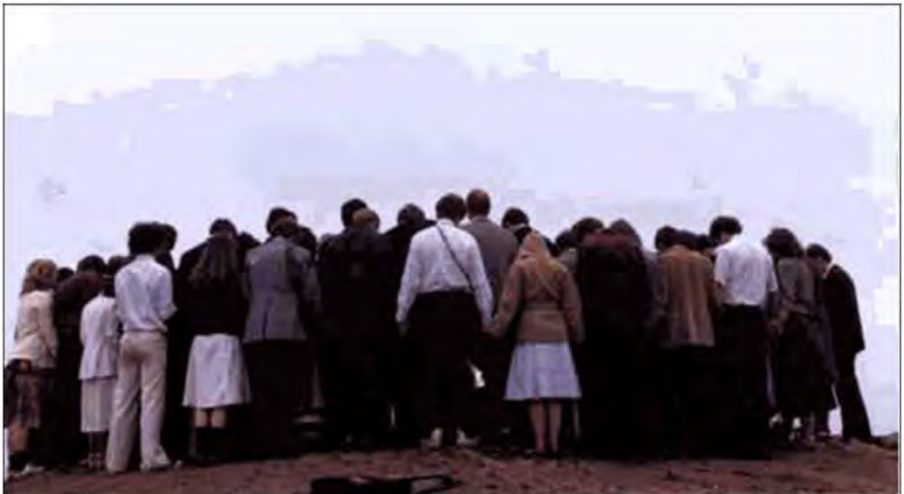
Praying at Twin Peaks, San Francisco, the first Holy Ground in America