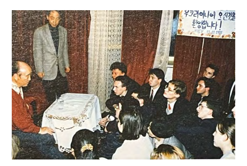
True Father speaks to members in Kiev, November 14, 1995