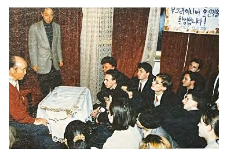
True Father speaks to members in Kiev, November 14, 1995