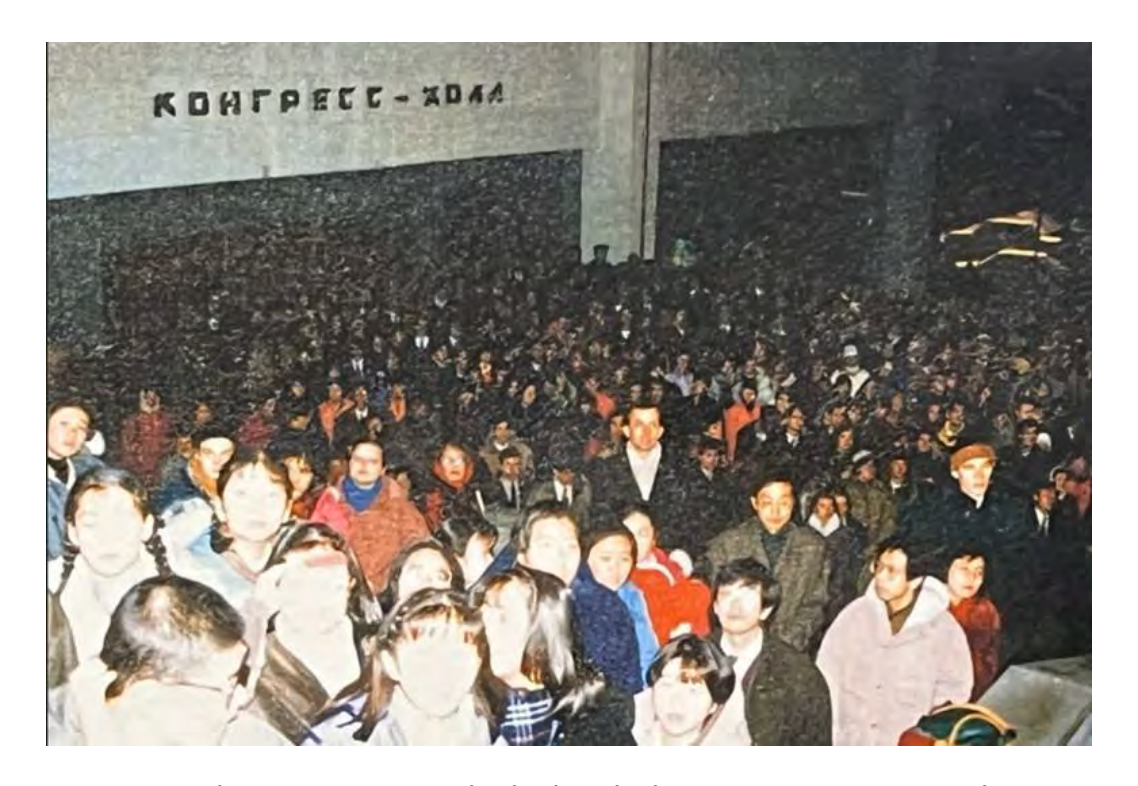
Members waiting outside the hotel where True Parents stayed