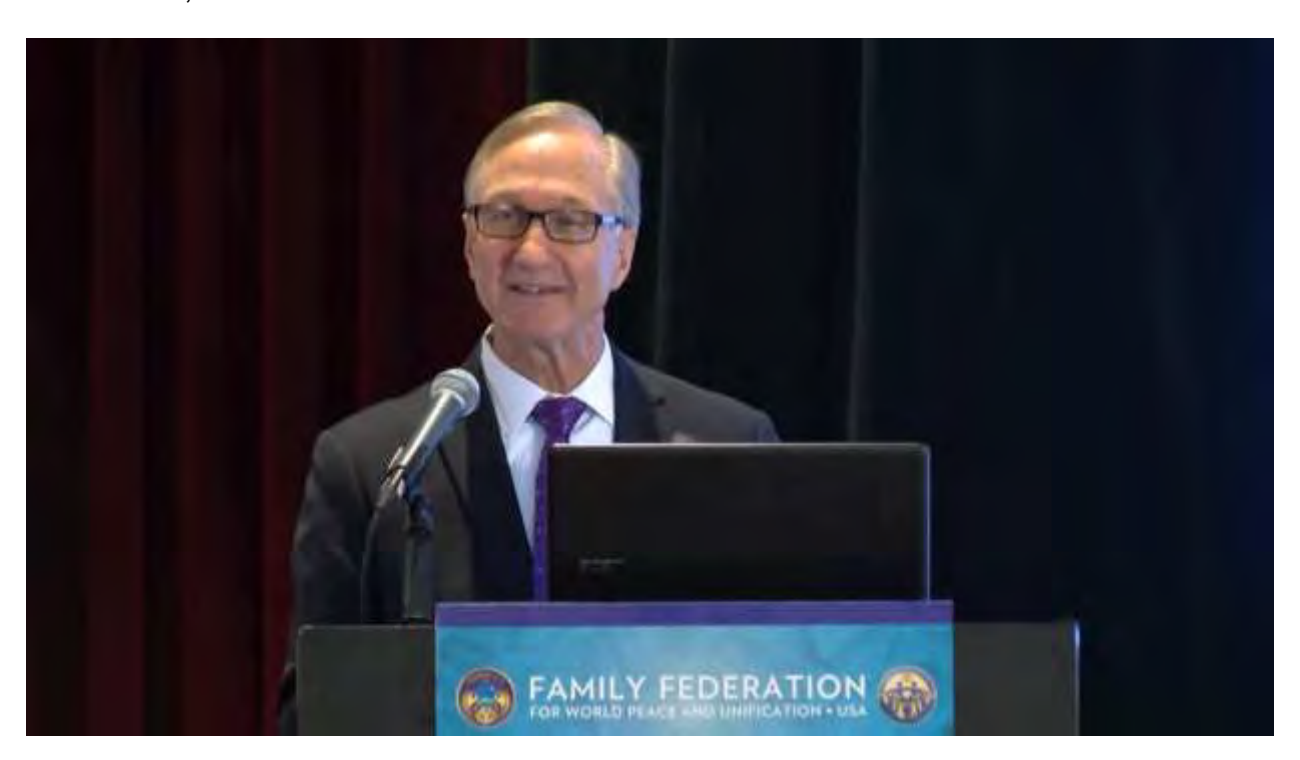
On October 11, the National Ministry Team gathered once again at the Crystal Ball Room of the New Yorker Hotel for their monthly meeting.

From True Father's 5th Seonghwa Anniversary, to the Hyojeong Cosmic Blessing, to Peace Starts With Me interfaith conference, to the celebration of Chuseok in Korea, there were numerous events for Unificationists to ruminate and reflect on from the past eventful month for the movement.