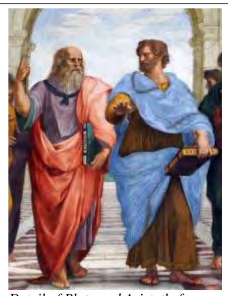
Detail of Plato and Aristotle from a fresco, "The School of Athens," by Raphael in the Apostolic Palace in Vatican City.

not subscribe to the independent existence of forms. Neither could prime matter be found anywhere by itself independent of form. Nevertheless, Aristotle proposed there was something about an existing being, its substance or essence, beyond that which we could experience of it through our senses. The substance or essence of any existing being is its prime matter plus universal aspects of its form. In this view of form and matter, even normal everyday objects such as a rock or tree necessarily have a supernatural, or formal, component.