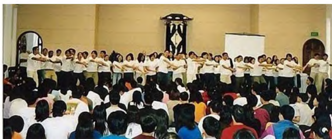
Also subject to faith-breaking attempts: Members of Soka Gakkai. Here students belonging to the faith in 2001.

(“deprogramming”) in Japan refers to the practice of coercively attempting to separate individuals from their religious affiliations or beliefs, typically through intervention by family members, professional faith-breakers (deprogrammers) or organizations hostile to new religious movements (NRMs). This phenomenon often targets members of such movements, e.g. relatively large faiths like the Family Federation or Jehovah's Witnesses, but also smaller groups like Happy Science (Kōfuku no Kagaku) and other newer religious movements.