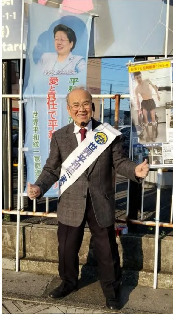
Freedom of religion includes the right to preach publicly: Here, a Japanese member of the Family Federation spreading the word on 15th March 2026, even though the religious organization had been dissolved by the authorities 11 days earlier.