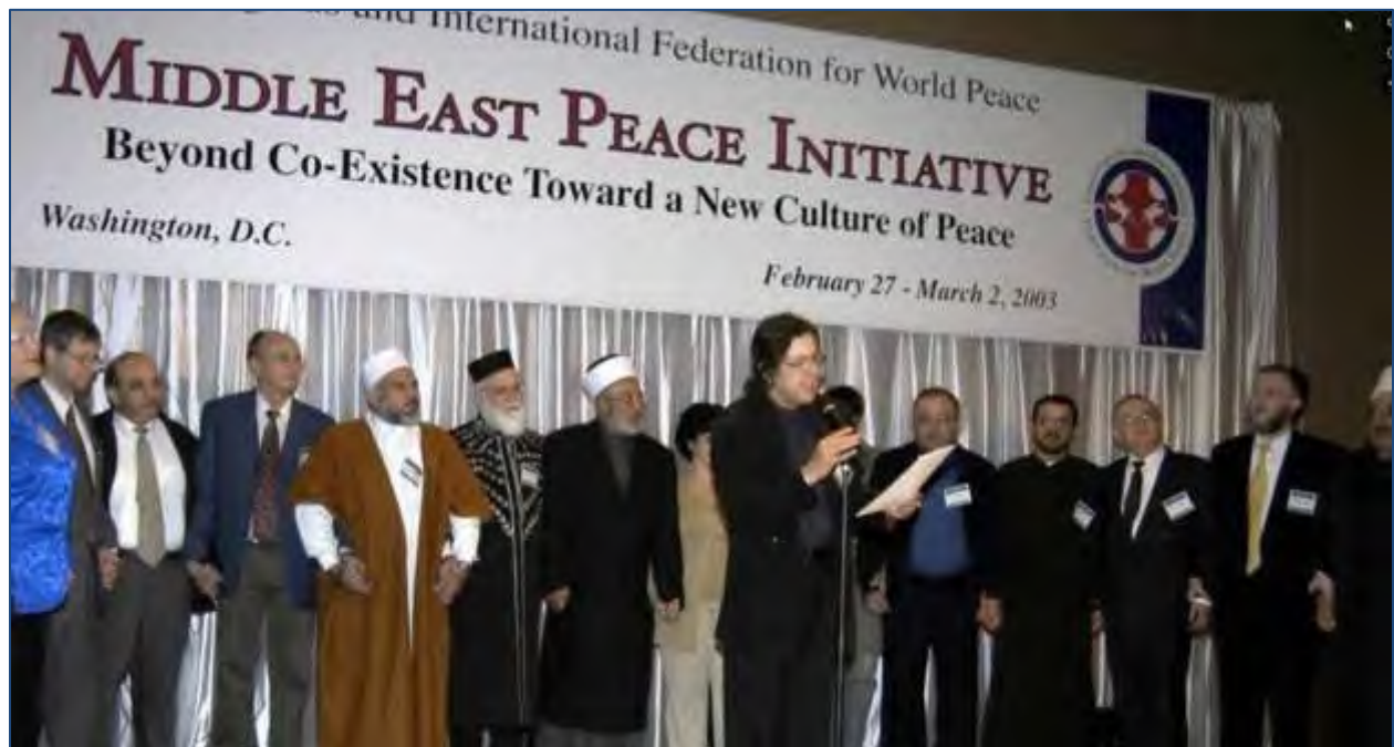
A vision for peace in the Middle East: From an interreligious conference on peace in the Middle East, held in Washington DC Feb. 27 - Mar. 2, 2003