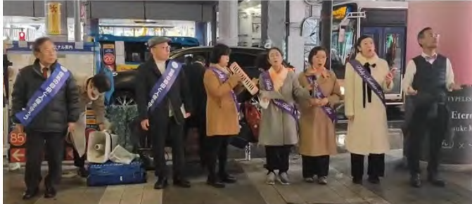
Demonstration at Shibuya Mark City in Tokyo against the religious persecution members of the Family Federation suffer in Japan.

He also accuses the Japanese media of functioning as a largely one-sided anti- Family Federation force unwilling to scrutinize procedural abuses if the target is sufficiently unpopular. Public opinion, he suggests, has become emotionally conditioned to accept extraordinary legal measures against the minority faith without reflecting on the wider implications for civil liberties.