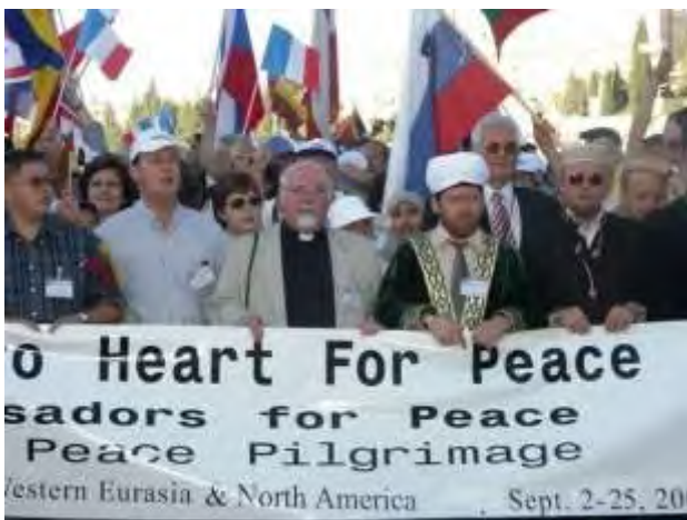
From one of many interreligious conferences and rallies for peace in the Middle East organized by Unificationism , this one in Jerusalem in September 2004