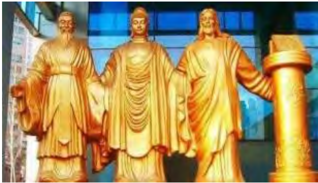
The "Four Great Saints" monument in front of the Family Federation place of worship known as the Cheonbok Temple in Cheongpa-dong, Yongsan-gu, Seoul. The figures represent Confucius, Buddha, Jesus, and Islam - symbolized by the Quran on a pedestal rather than a human figure, consistent with Islamic tradition. The monument was erected in 2011 dedicated to "harmony among religions and the realization of a peaceful world"

study of Islam led him to regard it as a serious and meaningful religious tradition.