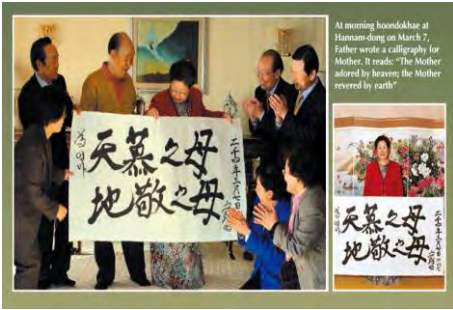
At morning hoonsidhae at Hannam-dong on March 7, Father wrote a calligraphy for Mother. It reads: "The Mother shared by Heaven, the Mother revered by earth"

In reality, before a mother gives birth to a baby, there is a 10-month period of pregnancy in the womb. That urgent gathering was actually a time that all humanity were conceived in True Parents womb and would be BORN AGAIN after 10 months which by counting would fall on the celebration of Foundation Day 2013.