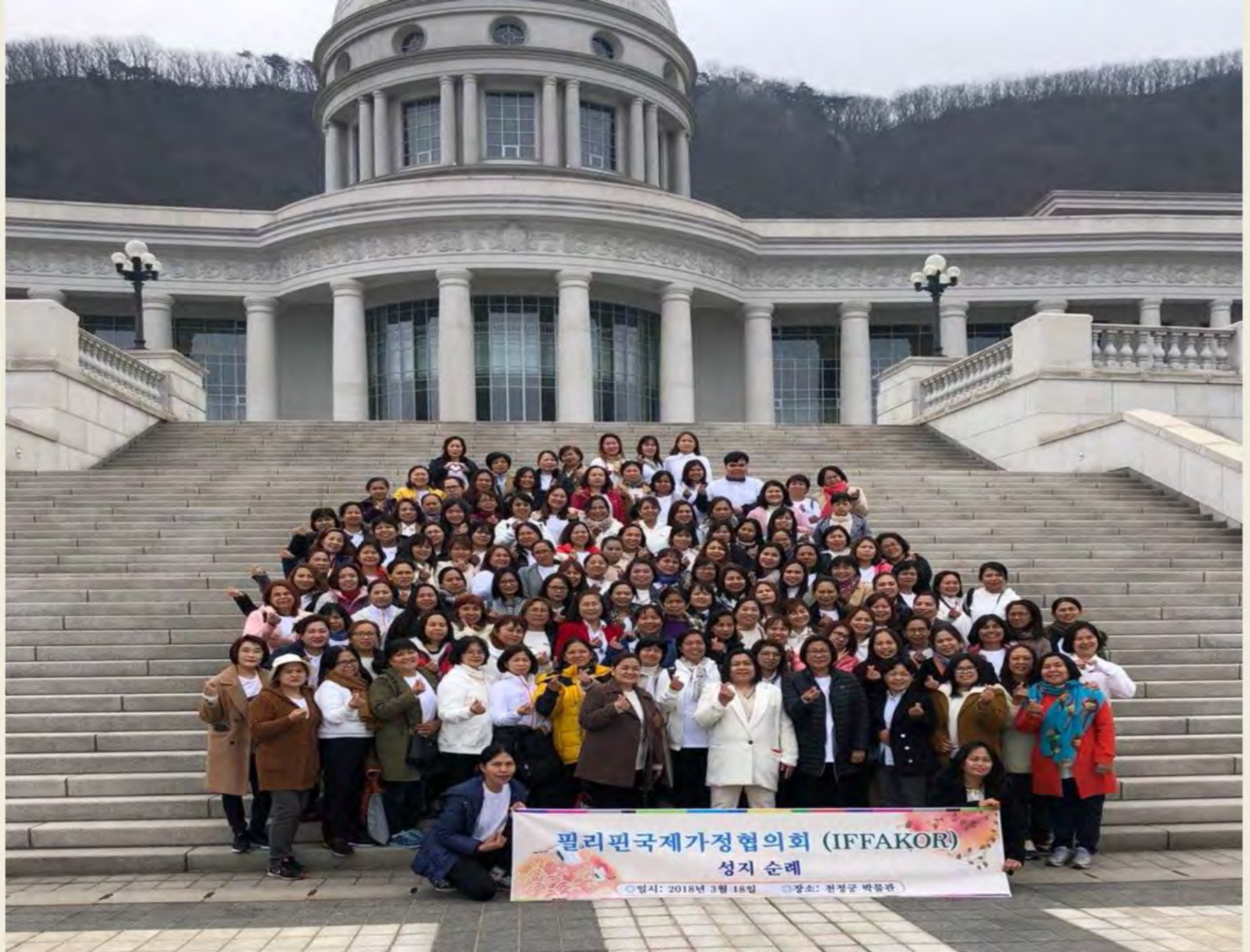
필리핀국제가정협의회 (IFFAKOR) 성지 순례 일시: 2018년 3월 18일 장소: 천정궁 박물관