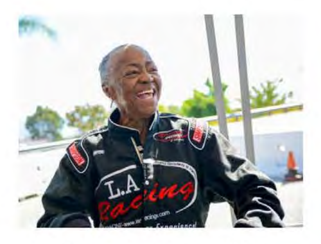
More about affiliation from AARP