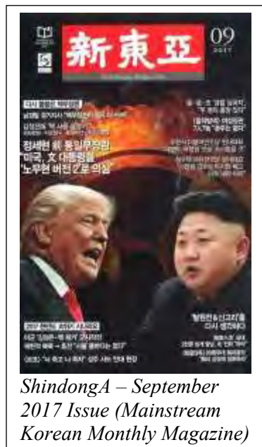
ShindongA – September 2017 Issue (Mainstream Korean Monthly Magazine)

'5th Anniversary of the Seonghwa of Rev. Sun Myung Moon' Family Federation for World Peace and Unification