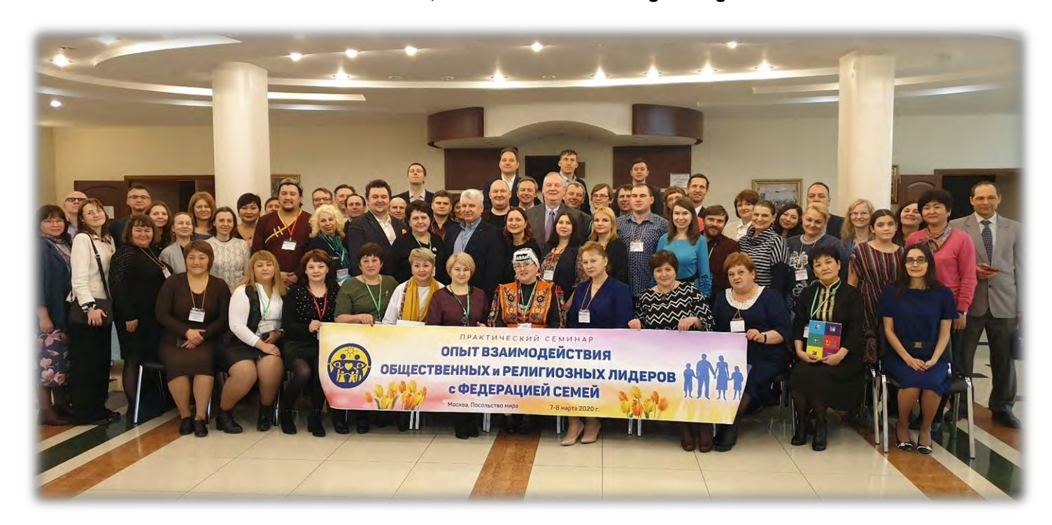
1-day special FFWPU workshop for VIPs and HTM contacts