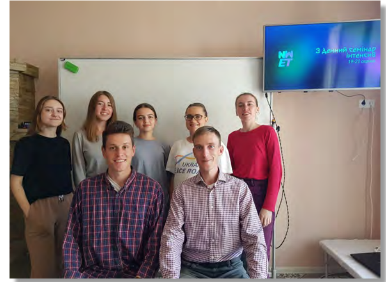
Ukrainian Second Gen activities in Poland