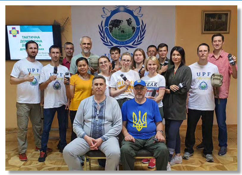
UPF Training in Kyiv