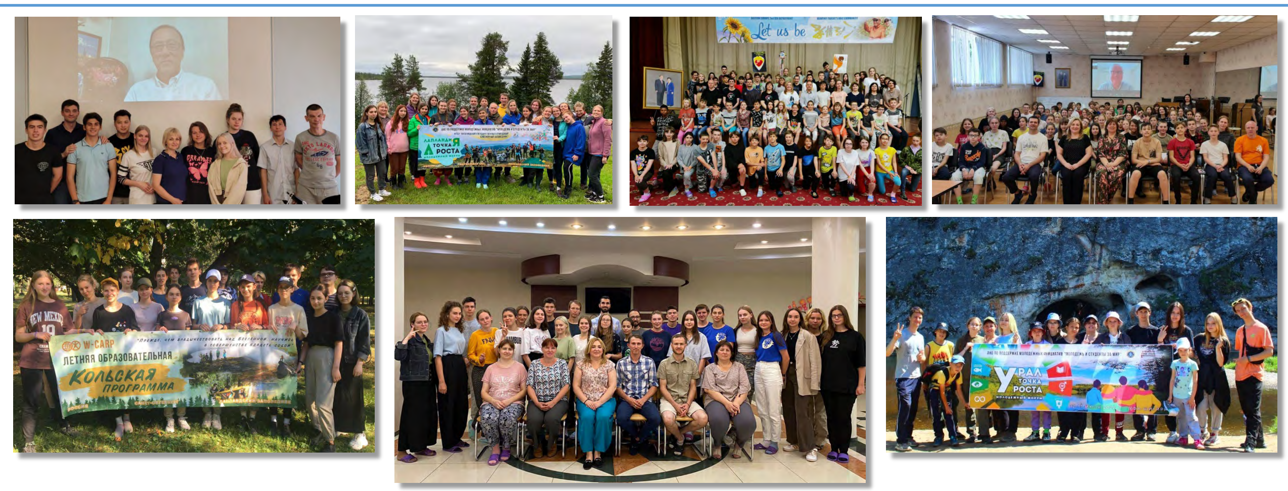
Kickoff Meeting in Moscow Headquarters