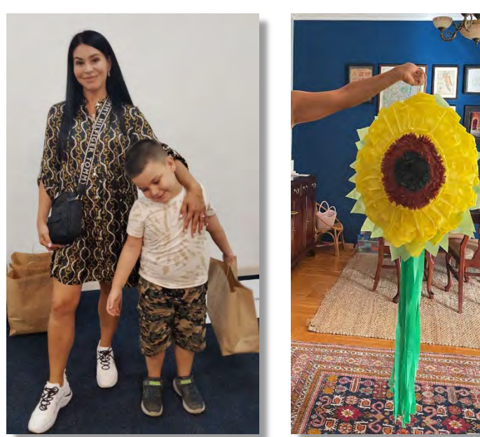
School Supplies and Piñata

Certificate of Gratitude from Ukrainian Ambassador