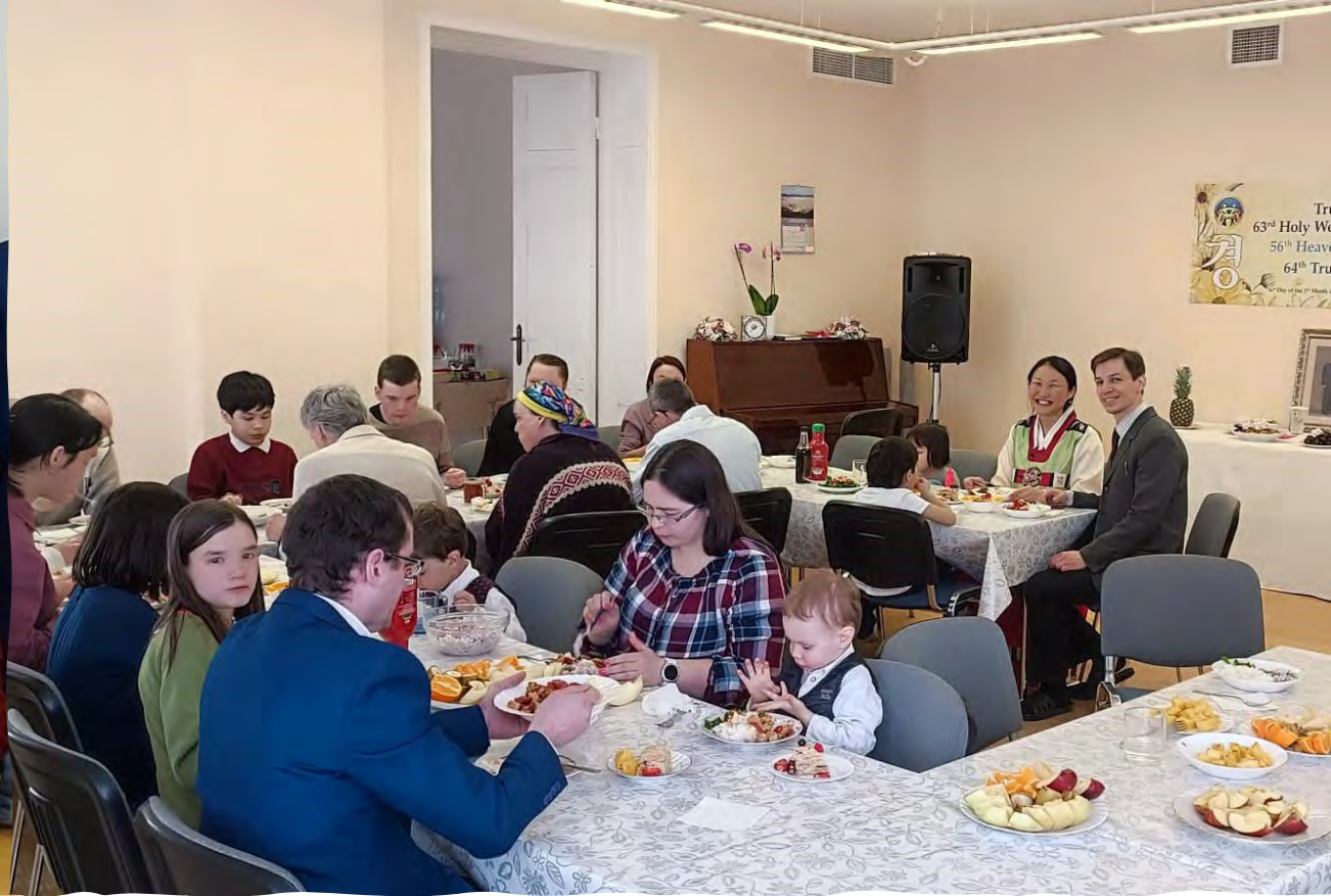
Celebrating the May Holy Days in the Peace Embassy in Riga, Latvia