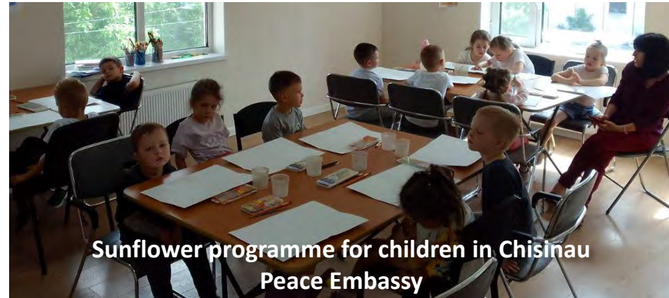
Sunflower programme for children in Chisinau Peace Embassy