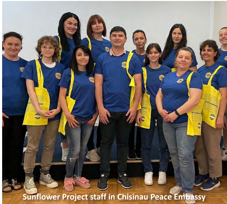
Sunflower Project staff in Chisinau Peace Embassy