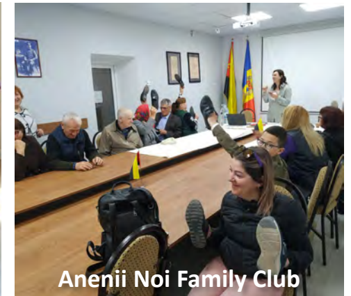
Anenii Noi Family Club