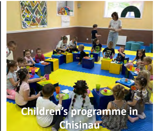
Children's programme in Chisinau