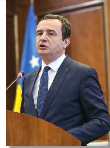
PM Albin Kurti