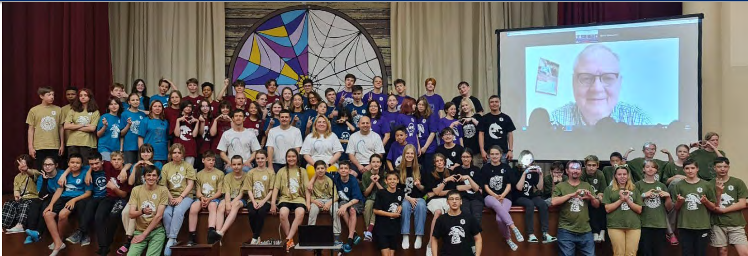
Sixty five participants 13-14 years old