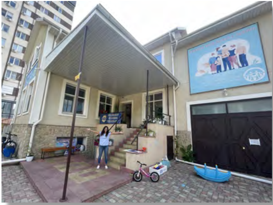
In front of the Peace Embassy in Chisinau, Moldova