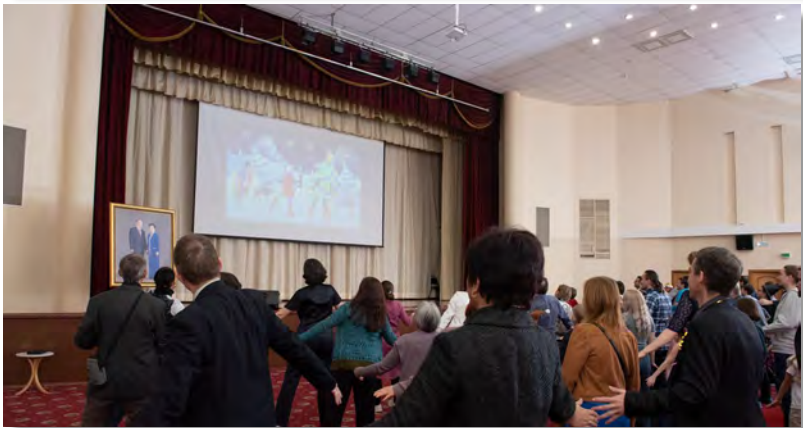
Year-End Sunday Service in Moscow Peace Embassy