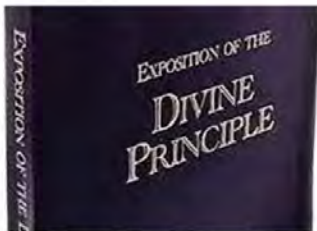
Exposition of the Divine Principle, published 1996.

philosophy with reference to the yang and yin of God that is manifested in all created beings, culminating in human beings as male and female.