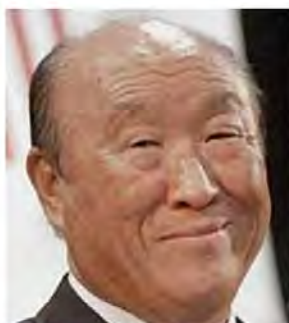
Father Moon.