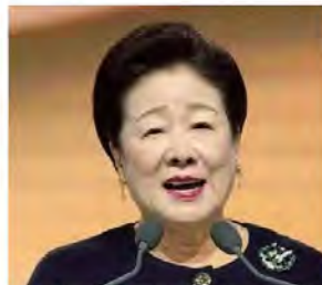
Mother Moon 4th Feb. 2020.

"We must now change how we address God . When we pray, we will change [the Korean word] 'Hanim' to [the Korean expression] 'Haneul Bumanim'. This is 'Heavenly Parent'. It is smooth in English and is also meaningful in Korean. Therefore, when you pray, the very first words you utter should be 'Heavenly Parent' [...]. (Speech by Mother Moon 7 th January 2013 in Gapyeong, South Korea)