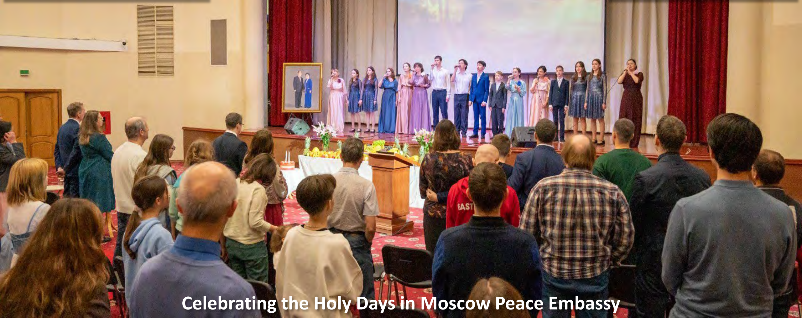
Celebrating the Holy Days in Moscow Peace Embassy