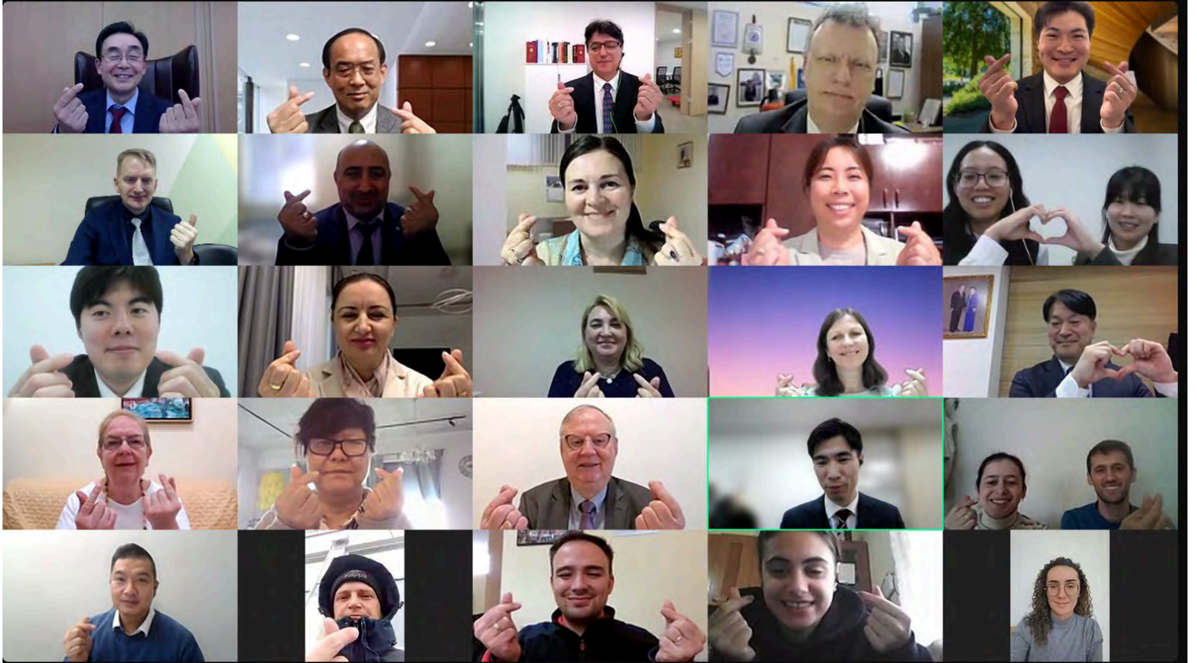
Eastern Europe Meeting with World Mission Headquarters