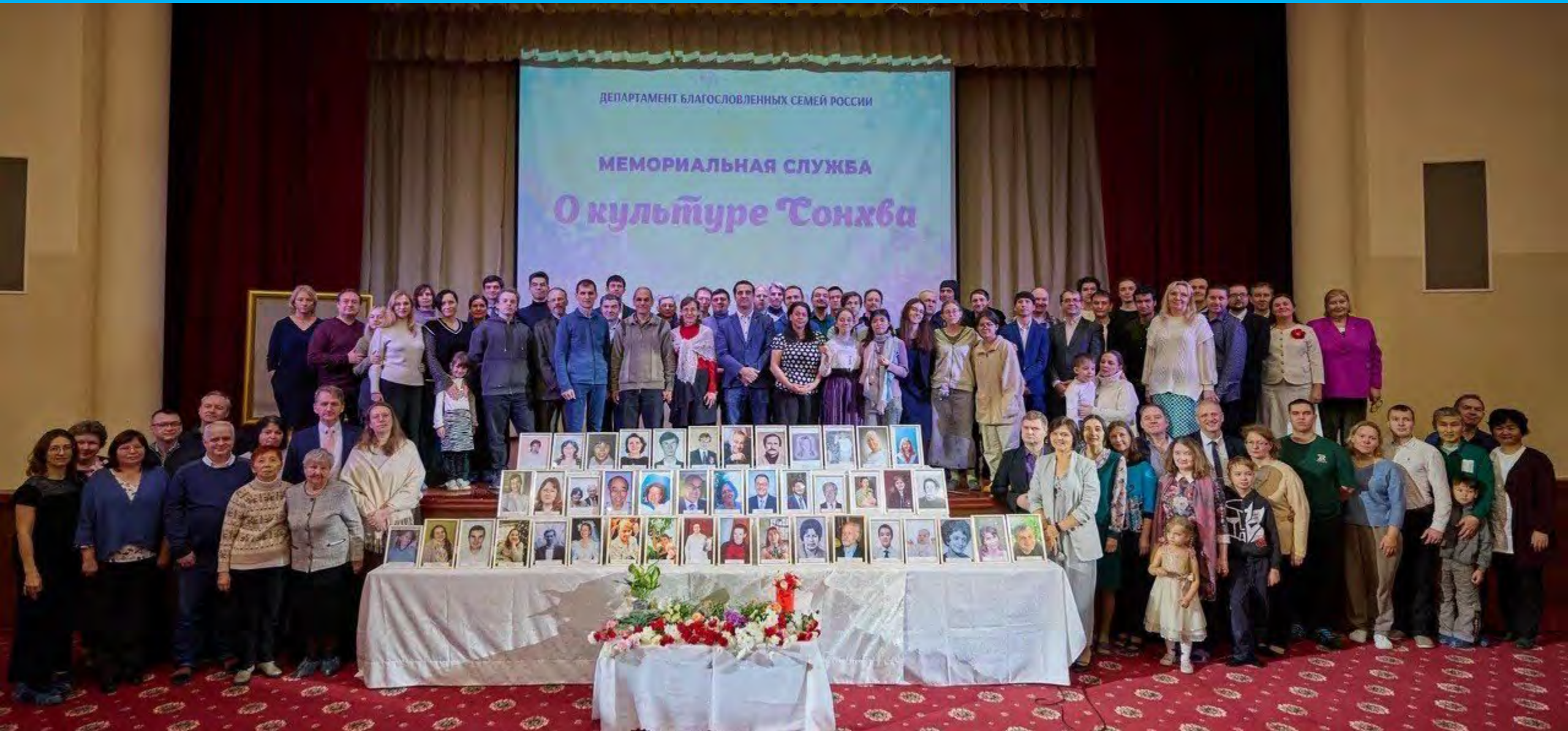
Memorial Service in Moscow Peace Embassy