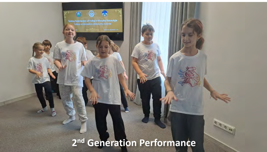
2 nd Generation Performance