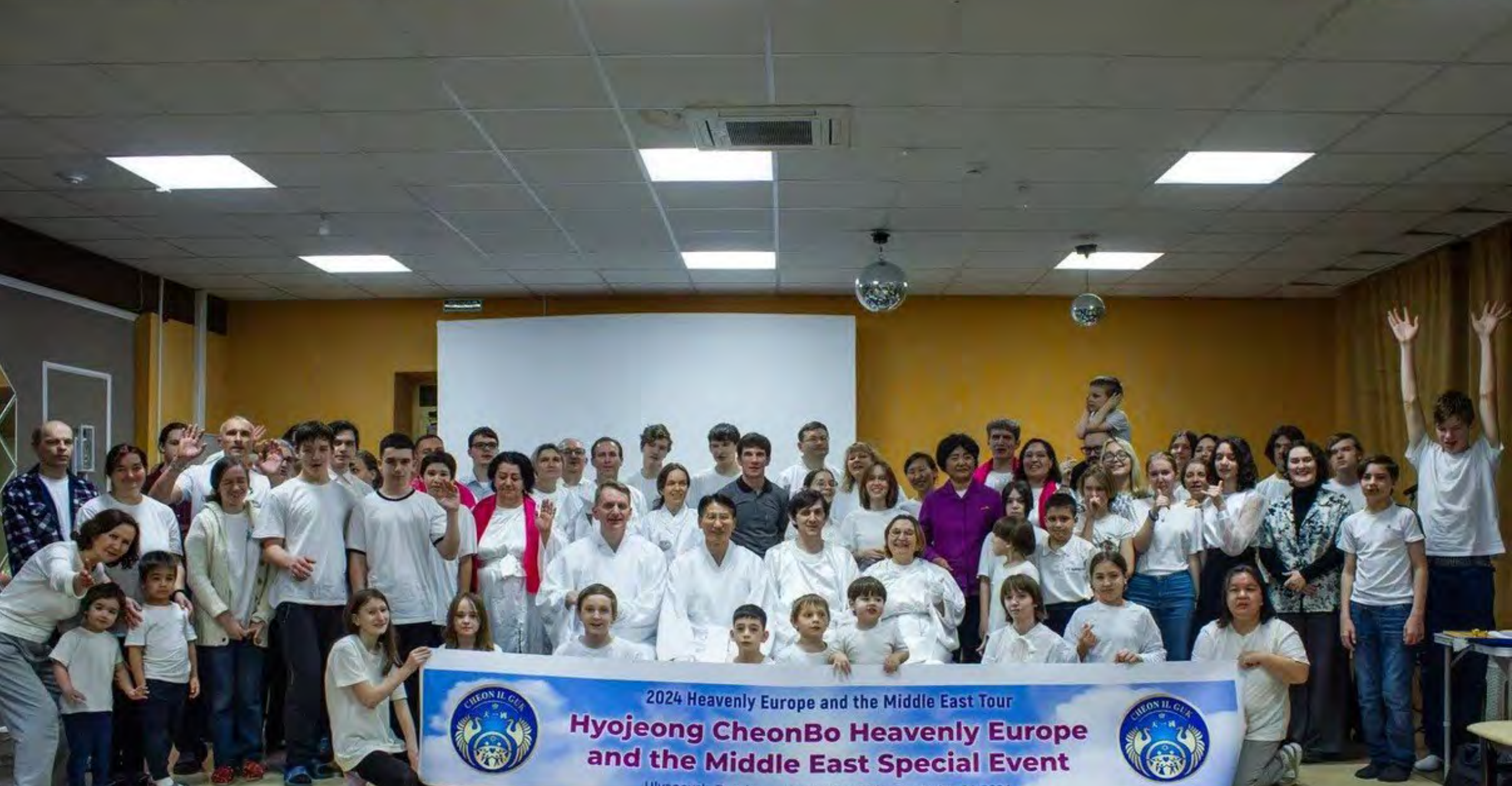
CheonBo Event in Ulyanovsk 30 November – 1 December 2024