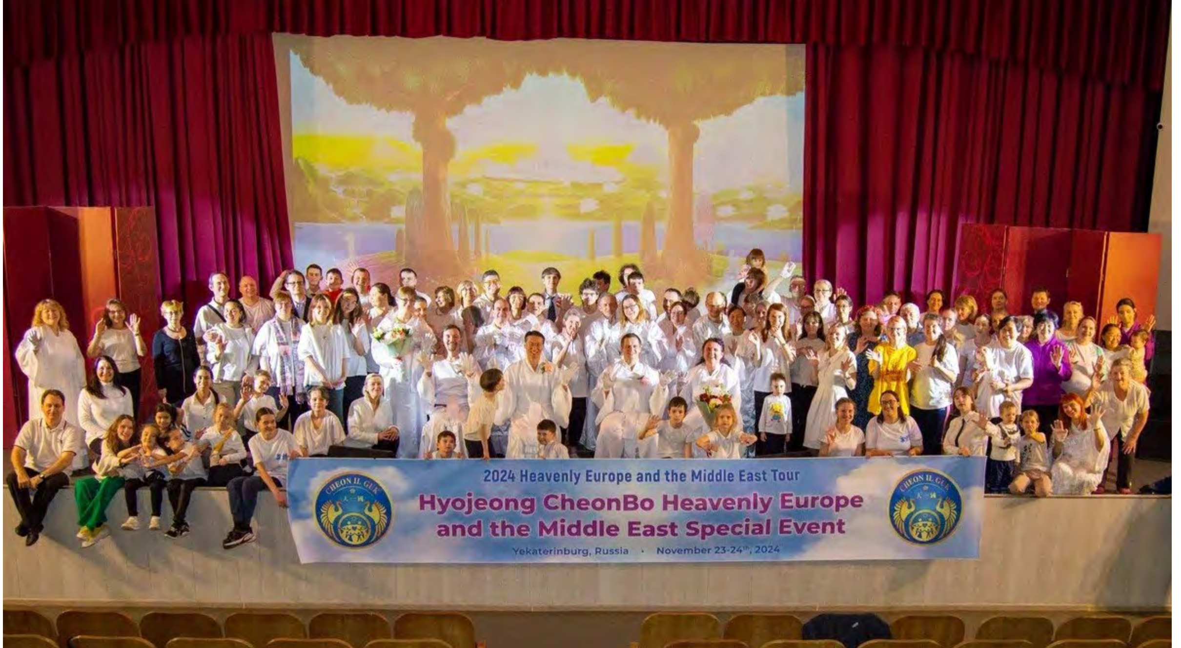
CheonBo Event in Yekaterinburg 23-24 November 2024