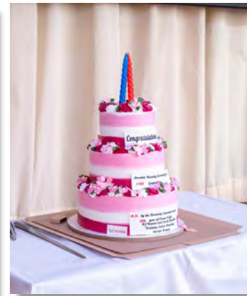
2024 Heavenly Europe and the M