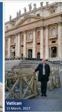
Vatican 15 March, 2017