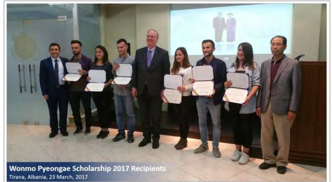
Wonmo Pyongae Scholarship 2017 Recipients Tirana, Albania, 23 March, 2017

The visit to Pristina, Kosovo, on the 24th likewise was packed full with meetings and visits with Ambassadors for Peace, government ministers, the head of the opposition political party, and members of the local Pristina FFWPU community.