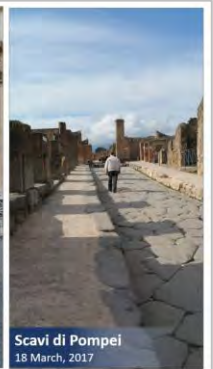
Scavi di Pompei 18 March, 2017