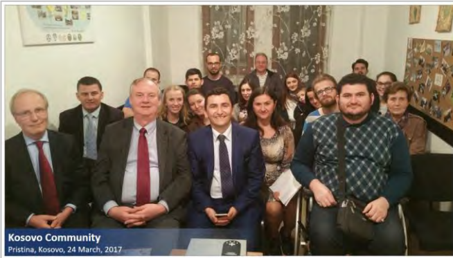
Kosovo Community Pristina, Kosovo, 24 March, 2017