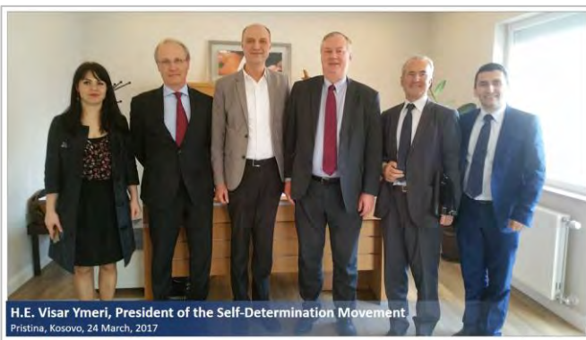
H.E. Visar Ymeri, President of the Self-Determination Movement Pristina, Kosovo, 24 March, 2017