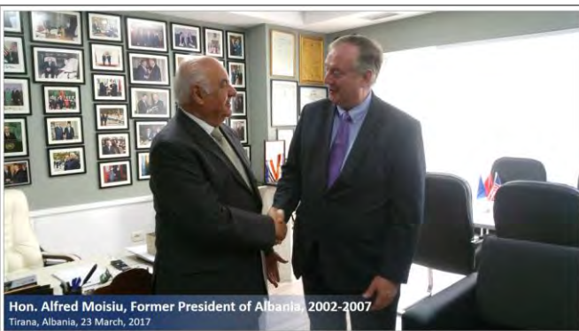
Hon. Alfred Moisiu, Former President of Albania, 2002-2007 Tirana, Albania, 23 March, 2017