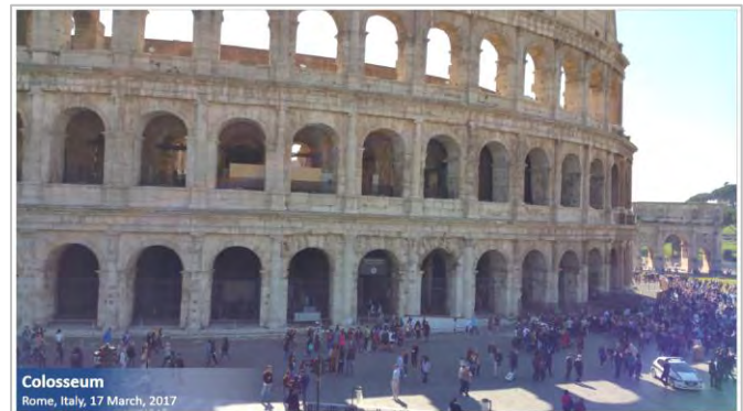
Colosseum Rome, Italy, 17 March, 2017