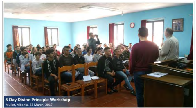
5 Day Divine Principle Workshop Mullet, Albania, 23 March, 2017