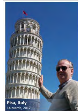
Pisa, Italy 14 March, 2017

Along with meetings and official events, we had the opportunity to visit several famous and historic sites, including the Leaning Tower of Pisa, the Vatican, the Colosseum in Rome, the ruins of Pompeii near Naples, the Acropolis in Athens and other famous sites from ancient Greece, as well as the Olympic Stadium built for the first modern Olympics in 1896.