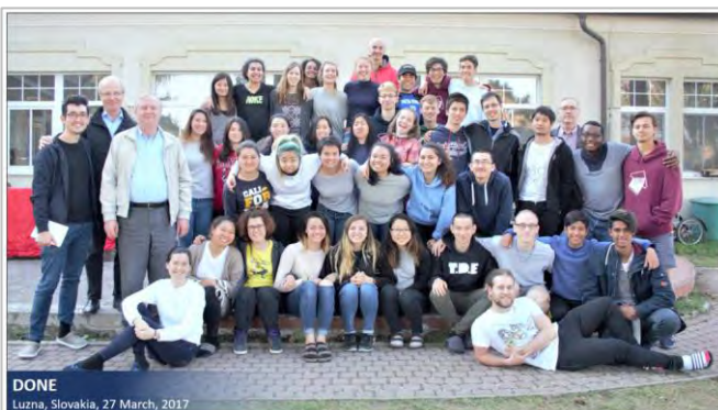
DONE Luzna, Slovakia, 27 March, 2017

On 27th March, we continued to the Luzhna workshop site in Slovakia for a meeting with ESGD leaders and an opportunity to greet the participants of the DONE program before moving on to Vienna, Austria, for a meeting on the following morning with