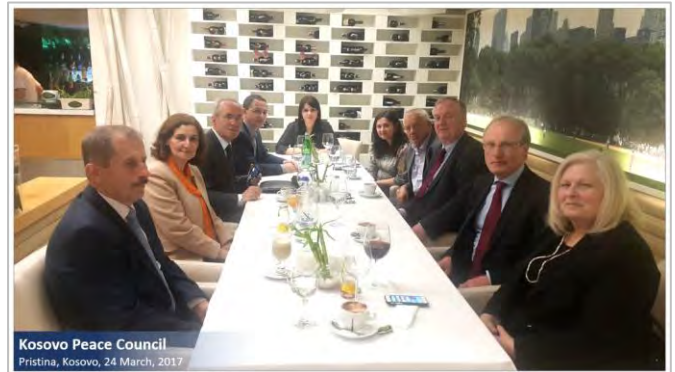
Kosovo Peace Council Pristina, Kosovo, 24 March, 2017

From our arrival in Tirana, Albania, on 22nd March until our departure for Kosovo two days later, we experienced a whirlwind of meetings and other activities. This included a meeting with the former president of Albania, Alfred Moisiu; lunch with Ambassadors for Peace; a courtesy call with the leader of a large Islamic community; a meeting with 60 guests at a five-day Divine Principle seminar at the Albanian training center at Mullit; and an evening with many local brothers and sisters at the Tirana headquarters. During that meeting, I had the privilege to present the Wonmo Pyongae Scholarship Certificates to six young Albanian brothers and sisters. Albania, being a Strategic Nation, is showing great progress in many fields of activity.