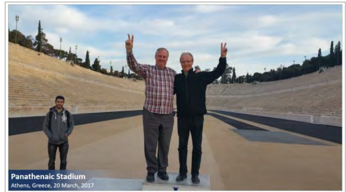
Panathenaic Stadium Athens, Greece, 20 March, 2017

During this trip, I once more came to a new appreciation of the faithful devotion of brothers and sisters in the region. I felt that, despite many challenges to living a life of faith in an increasingly secularized world, our European brothers and sisters are beacons of hope in their respective communities and will be honored by history for their love and devotion to True Parents and the heavenly providence at this time.