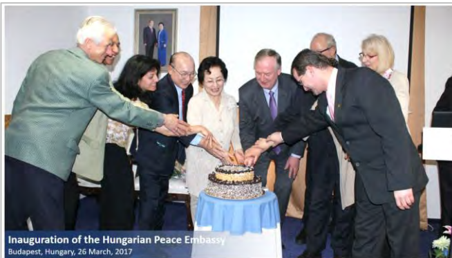
Inauguration of the Hungarian Peace Embassy Budapest, Hungary, 26 March, 2017