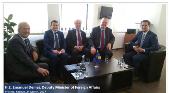
H.E. Emanuel Demaj, Deputy Minister of Foreign Affairs Pristina, Kosovo, 24 March, 2017