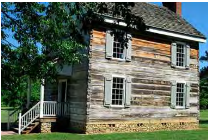
After the video presentation in the New Echota Museum, the participants walked to the reconstructed Council House where the Healing Ceremony was held in the upper room.