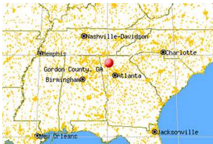
Location of New Echota

the sun came out so that the participants could enjoy a picnic on the grounds.