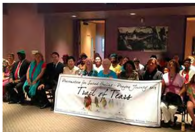
Participants at the opening ceremony of the Prayer Journey at the New Echota Welcome Center's theater.

New Echota in Northwest Georgia was selected for the start of the Peacemakers' healing pilgrimage, because it was the Capitol of the Cherokee before President Andrew Jackson forced the removal of the Cherokee to Indian Territory in 1838. Many thousands of Cherokee died on that winter journey to present-day Oklahoma. The removal from their homes and the subsequent death march is known by the Cherokee as their "Trail of Tears."