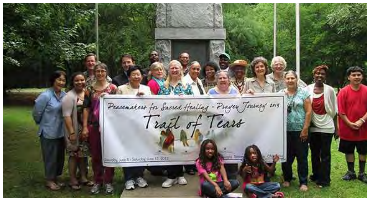
Some of the Peacemakers for Sacred Healing group members and participants of the kickoff for the Trail of Tears Prayer Journey.

Seven pilgrims of the Peacemakers for Sacred Healing were welcomed at the New Echota Historic Site near Calhoun, Georgia on Saturday June 8, 2013 as they launched their 1,000-mile Trail of Tears Prayer Journey. Nearly forty people gathered to welcome the Peacemakers, including pastors of the American Clergy Leadership Conference (ACLC), leaders of Women's Federation for World Peace (WFWP) and members of the Family Federation for World Peace and Unification (FFWPU).