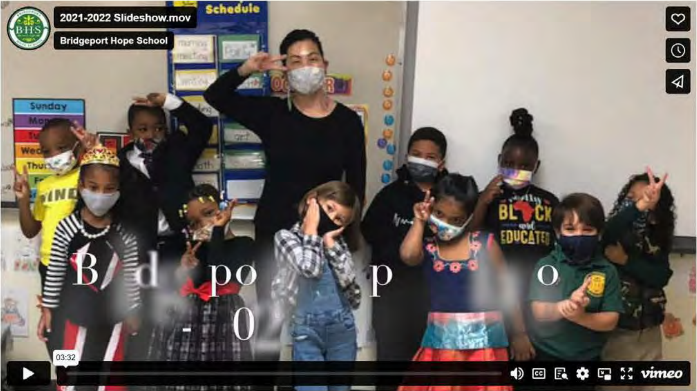
BHS Slideshow 21/22 - "These Small Hours"