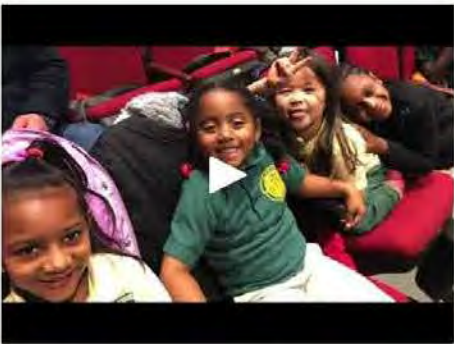
BHS Slideshow 18/19 - "Loosen Up"