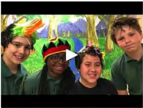
BHS Slideshow 17/18 - "Remember My Name"