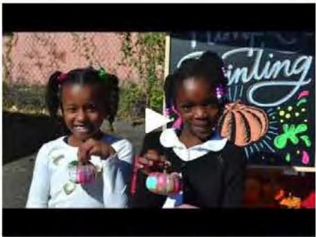
BHS Slideshow 16/17 - "Best Friend"