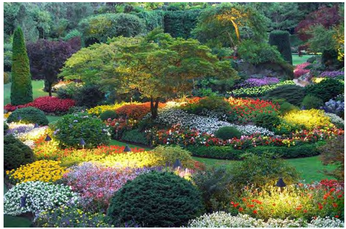
Photo source Butchart Gardens on Vancouver Island, near Victoria, British Columbia, Canada

At this time when we are in adversity, after putting the load of burden down, we should be able to say proudly, "I am emancipated. I have hope, happiness, and I love all things in Heaven and on earth." We should also become people who can transcend the standard in which we have already removed the sorrow of God and that of the creation.