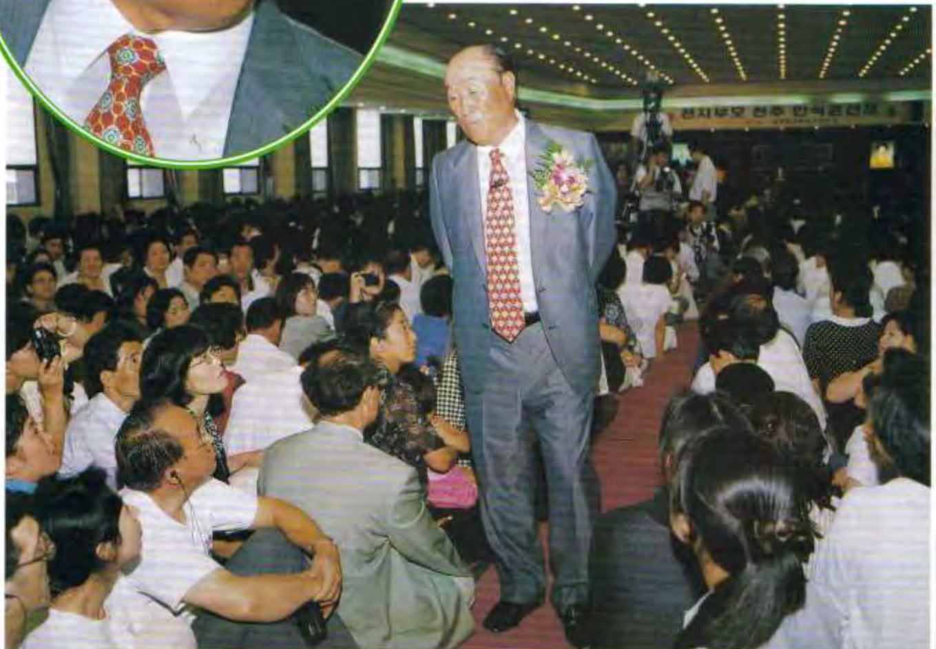
Father explains that at last God can rest in a nation, the world and the cosmos. August 9, 1997.