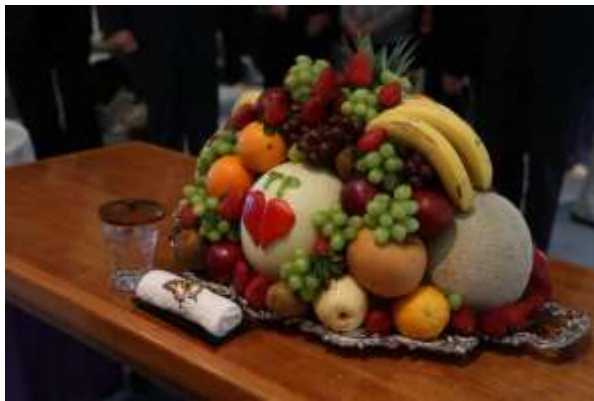
▲ 3. Sample offering table: True Parents started a new tradition to set the offering table at Cheon Hwa Gung