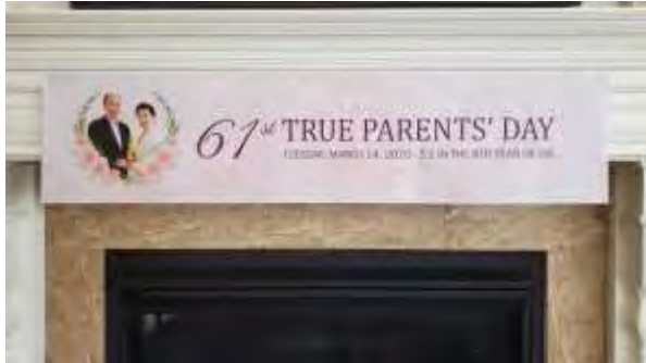
▲ 2. True Parents' Day banner is ready for tomorrow