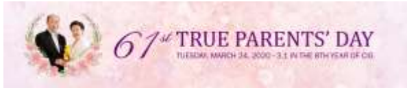
▲ 1. Sample banner