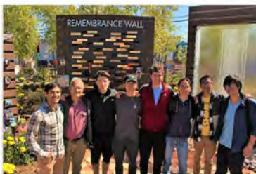
March 9, 2019 @ Las Vegas Community Healing Garden