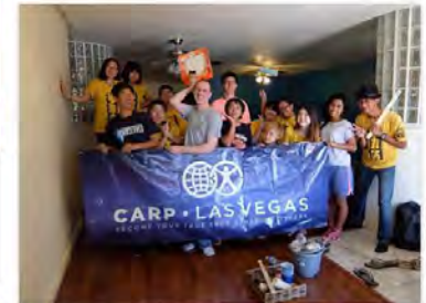
August 22, 2014 @ CARP Las Vegas House