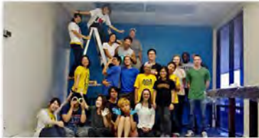
August 16, 2014 @ CARP Las Vegas Learning Center