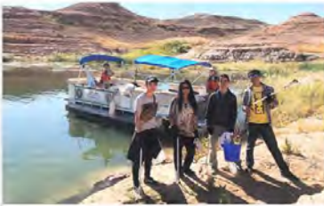
October 20, 2018 @ 33 Hole Overlook, Lake Mead