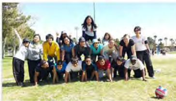
Shine City Project's 1st Anniversary (March 15, 2014 @ Sunset Park)