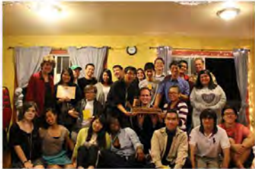
Shine City Project's 2nd Anniversary Celebration (March 14, 2015)