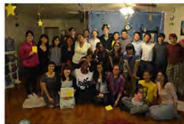
Shine City Project's 3rd Anniversary Celebration (March 18, 2016)