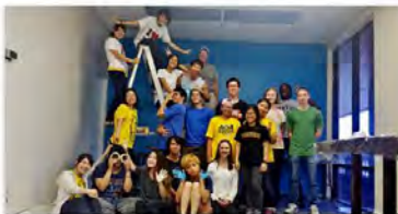
August 16, 2014 @ CARP Las Vegas Learning Center