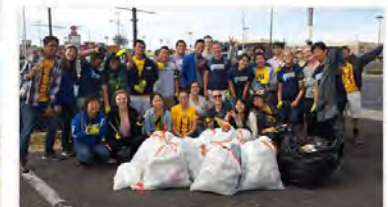
April 25, 2014 @ El Pollo Loco