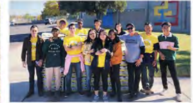
November 9, 2019 @ Just One Project - Helen Marie Smith Elementary School