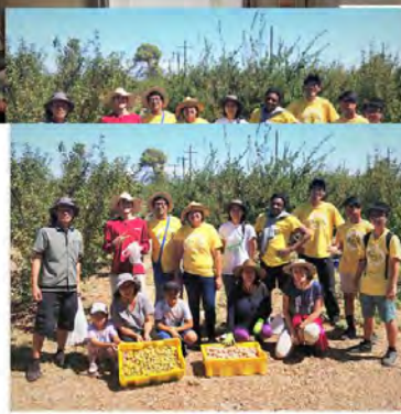
August 6, 2022 @ Ahern Orchard