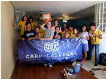
August 22, 2014 @ CARP Las Vegas House