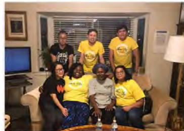
July 24, 2021 @ Harrison House