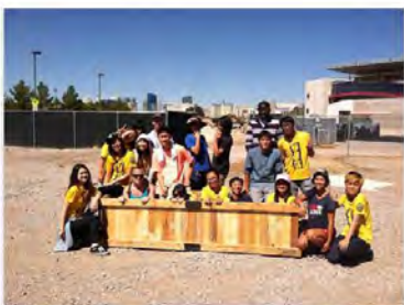
October 13, 2018 @ Las Vegas Wash with Generation Peace Academy