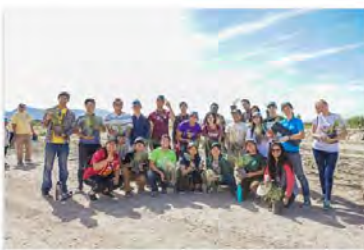
October 13, 2018 @ Las Vegas Wash with Generation Peace Academy