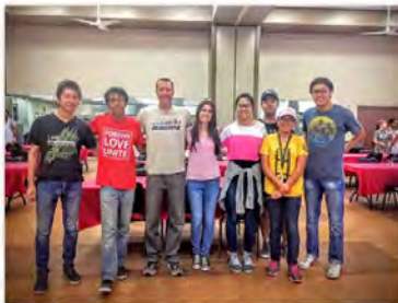
July 31, 2015 @ Las Vegas Rescue Mission