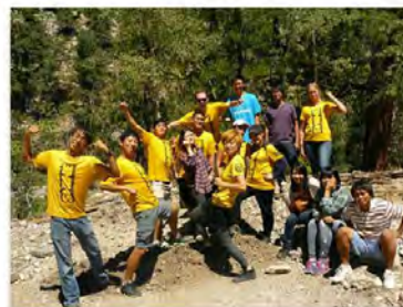
August 15, 2014 @ Mt. Charleston