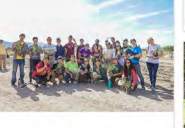
October 13, 2018 @ Las Vegas Wash with Generation Peace Academy