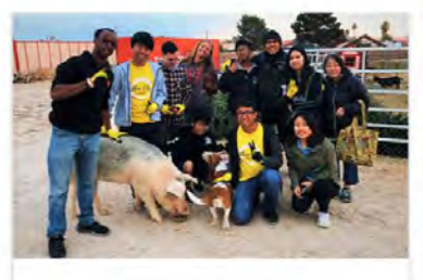
January 12, 2020 @ All Friends Animal Sanctuary