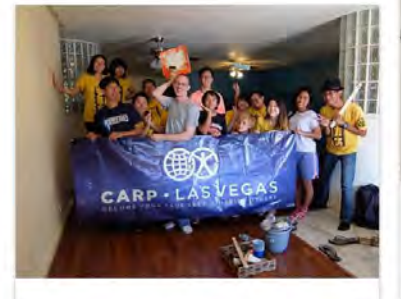
August 22, 2014 @ CARP Las Vegas House