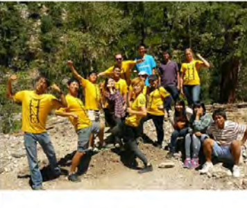
August 15, 2014 @ Mt. Charleston