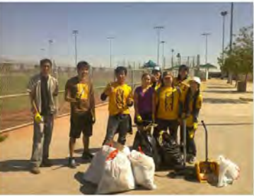
April 26, 2013 @ Lorenzi Park