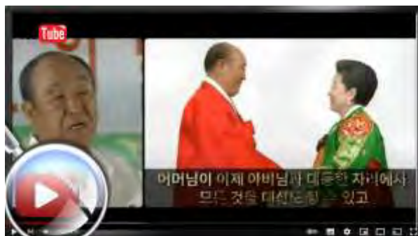
True Parents 103rd and 80th Birthday Video

New Year Kick Off Sunday, February 5th will be our new year kickoff, appreciation, bouncer and YUT game