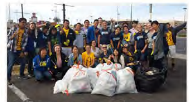
April 25, 2014 @ El Pollo Loco