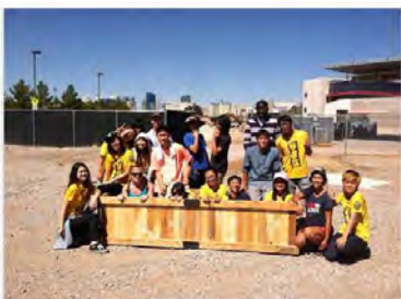
October 13, 2018 @ Las Vegas Wash with Generation Peace Academy