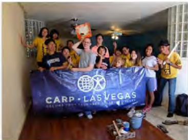
August 22, 2014 @ CARP Las Vegas House