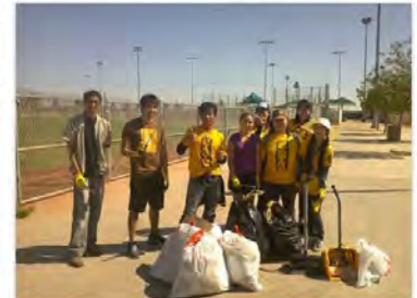
April 26, 2013 @ Lorenzi Park