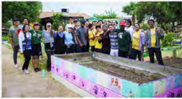
May 29, 2021 @ Vegas Roots Community Garden