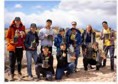
March 2, 2019 @ Las Vegas Wash