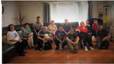
June 8, 2019 @ Silver Horizon Group Home