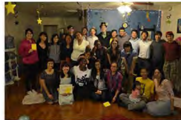
Shine City Project's 3rd Anniversary Celebration (March 18, 2016)