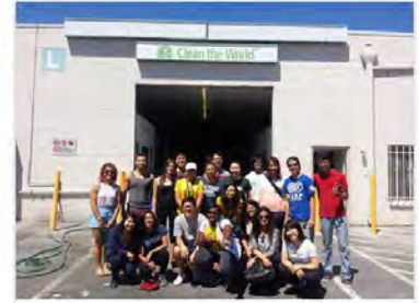
July 25, 2015 @ Clean the World