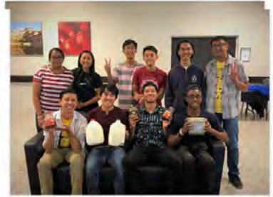
May 4, 2019 @ Club Christ Ladies Tea