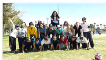
Shine City Project's 1st Anniversary (March 15, 2014 @ Sunset Park)