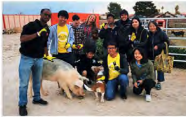
January 12, 2020 @ All Friends Animal Sanctuary