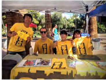
September 2, 2015 @ UNLV Involvement Fair