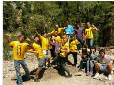
August 15, 2014 @ Mt. Charleston