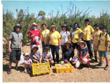
August 6, 2022 @ Ahern Orchard