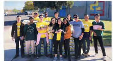
November 9, 2019 @ Just One Project – Helen Marie Smith Elementary School