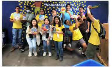
June 11, 2022 @ Spread the Word Nevada