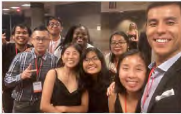
October 2, 2021 @ Shaquille O'Neal Foundation – The Event