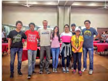
July 31, 2015 @ Las Vegas Rescue Mission