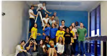
August 16, 2014 @ CARP Las Vegas Learning Center