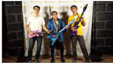
October 30, 2015 @ Haunted Harvest, Springs Preserve