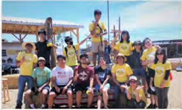
May 7, 2022 @ McKee Ranch Foundation