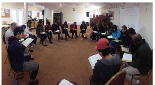
March 20<sup>th</sup> marks last day of the 7th 40-Day HD Jungsung condition totaling 280 days from the start.