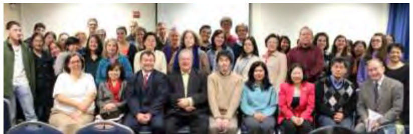
Students, speakers and survivors at the GWU Amnesty Int’l event.